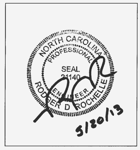
Transportation Program Management Director

Accompanying the Design-Build Proposal shall be a bid bond secured by a corporate surety, or certified check payable to the order of the Department of Transportation, for five percent of the total bid price, which deposit is to be forfeited as liquidated damages in case this bid is accepted and the Design-Build Team shall fail to provide the required payment and performance bonds with the Department of Transportation, under the condition of this proposal, within 14 calendar days after the written notice of award is received by them, as provided in the Standard Specifications; otherwise said deposit will be returned to the Design-Build Team.