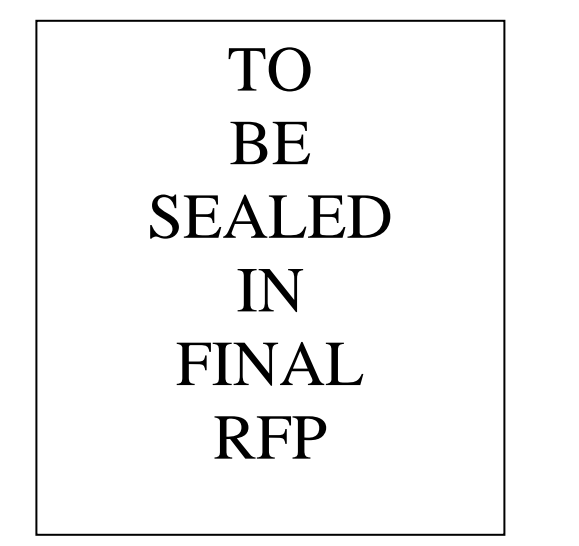
Administrator of the Technical Services Division

Accompanying the Design-Build Proposal shall be a bid bond secured by a corporate surety, or certified check payable to the order of the Department of Transportation, for five percent of the total bid price, which deposit is to be forfeited as liquidated damages in case this bid is accepted and the Design-Build Team shall fail to provide the required payment and performance bonds with the Department of Transportation, under the condition of this proposal, within 14 calendar days after the written notice of award is received by them, as provided in the Standard Specifications; otherwise said deposit will be returned to the Design-Build Team.