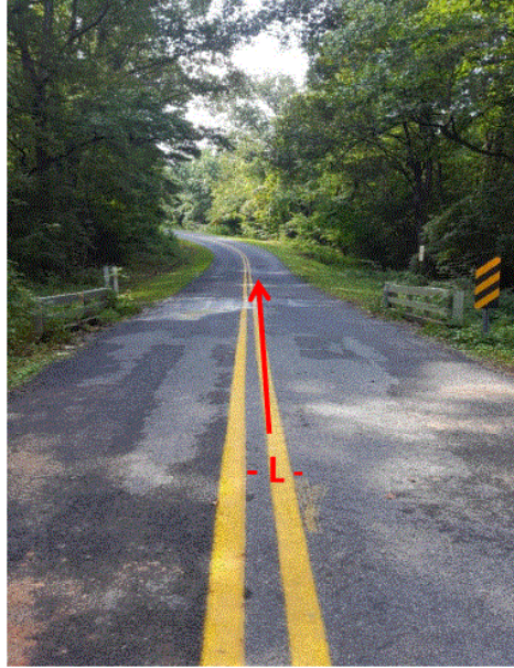
Photograph No. 1: View looking towards EB1 to EB2