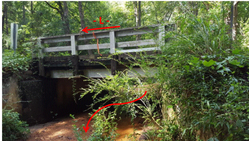
Photograph No. 2: View facing upstream.