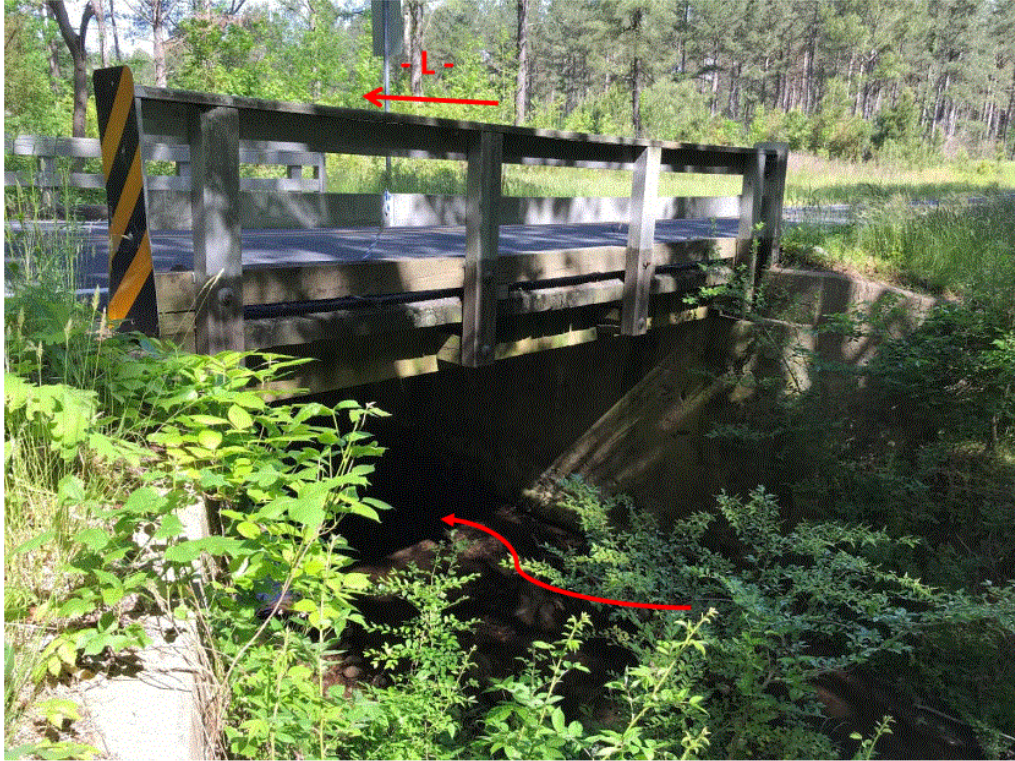
View looking downstream.