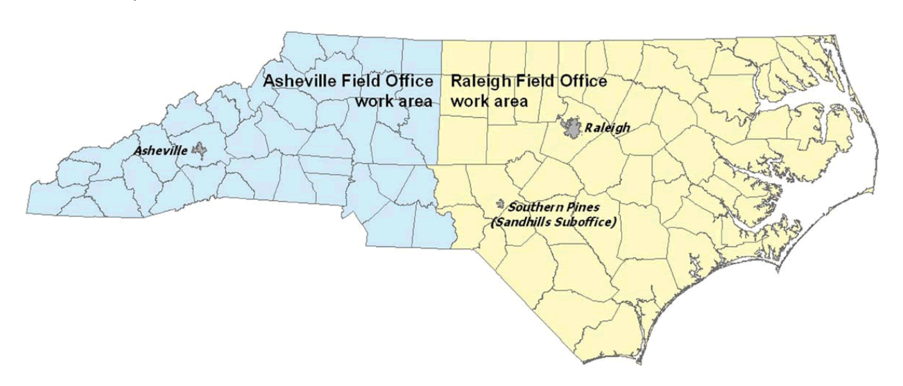
Asheville U.S. Fish and Wildlife Service Office counties: All counties west of and including Anson, Stanly, Davidson, Forsythe and Stokes Counties.

Below is a map of the USFWS Field Office Boundaries: