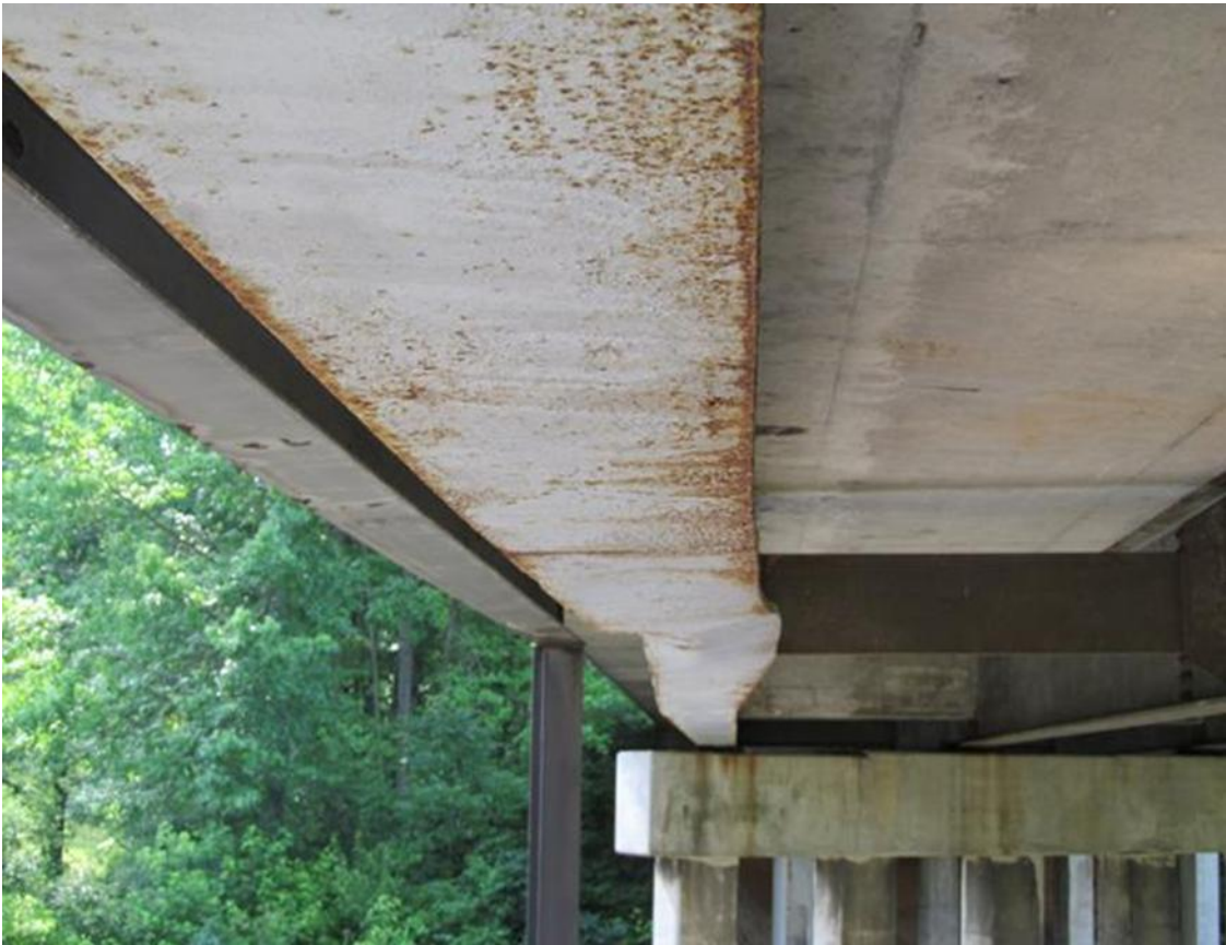
BEAM #1 OF SPAN #2. APPROX. 5" OF SWEEP