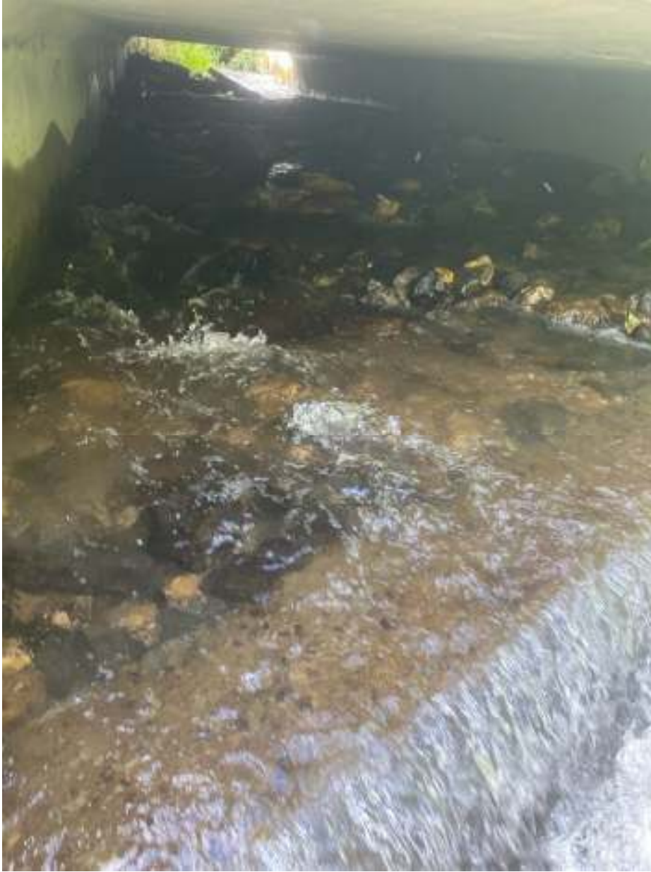
Yancey 175 about 100 feet upstream of Yancey 120 (note low hydraulic jumps at inlet in background and outlet in foreground).