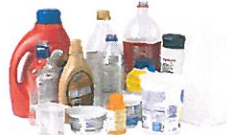
Plastic Bottles and Containers #1-7 Botellas de plástico y recipientes #1-7