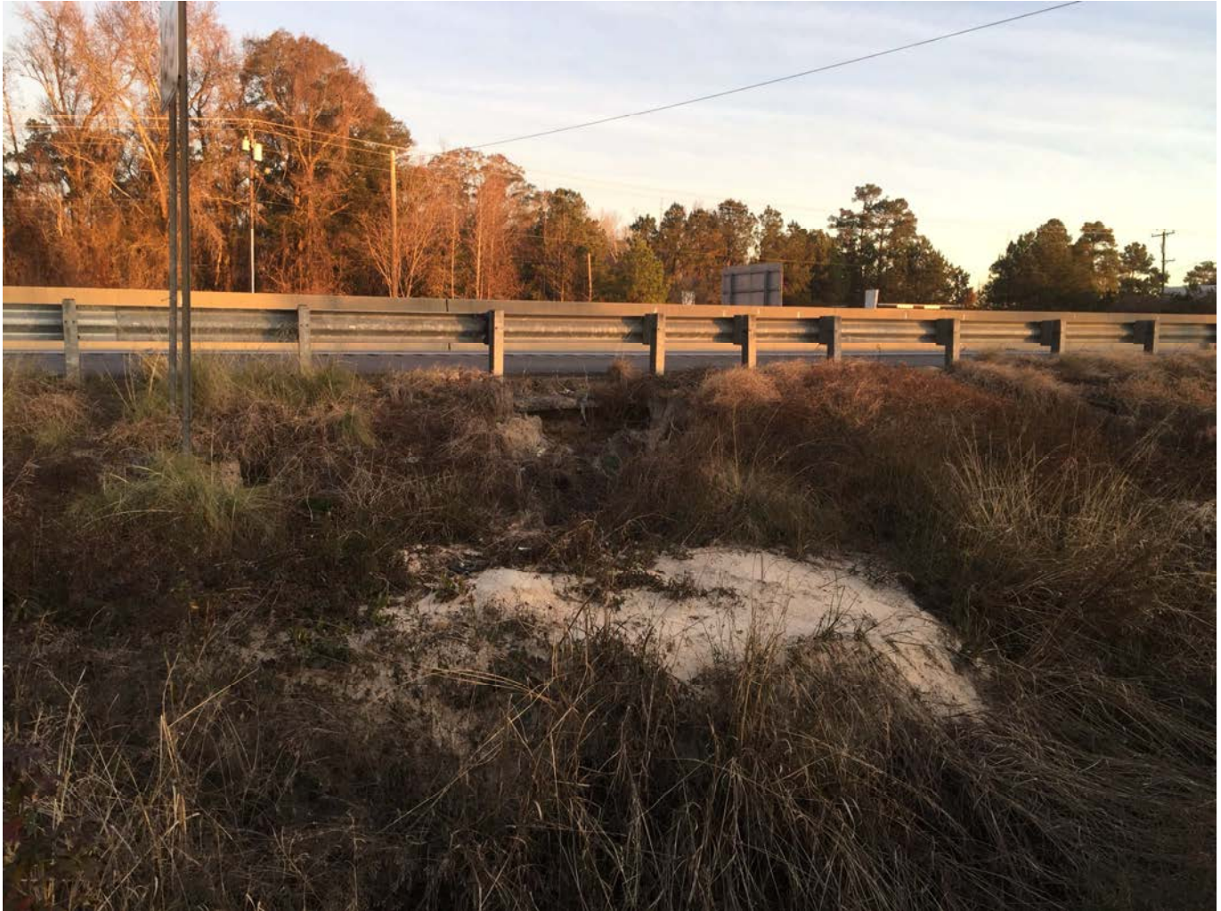
North of Exit 17, adjacent to the NB lane

This site is located north of Exit 17. This site consists of slope repair.