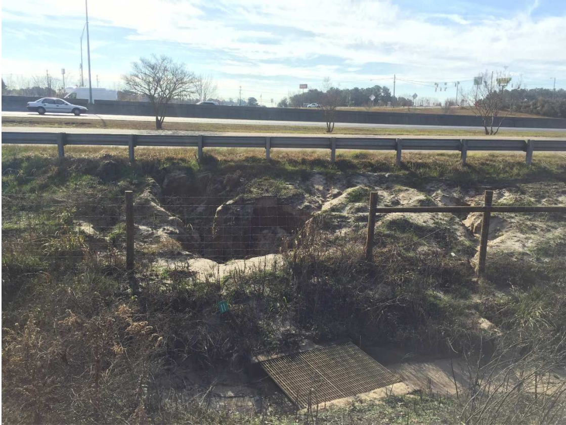
Adjacent to SB off Ramp Exit 17

The site is located near the gore of the southbound off ramp at Exit 17. This site consists of grading and matting for slope repair.