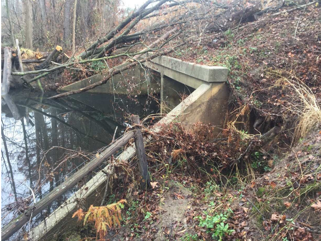
Adjacent to SB lane south of Exit 7

An existing concrete box culvert is scoured out and will require flowable fill. The area will be enclosed via an impervious dike, dewatered, and flowable fill will be placed under the culvert. The area will be re-graded and seeded and matted using coir-fiber matting. Work will be required on both the NB and SB sides at this location.