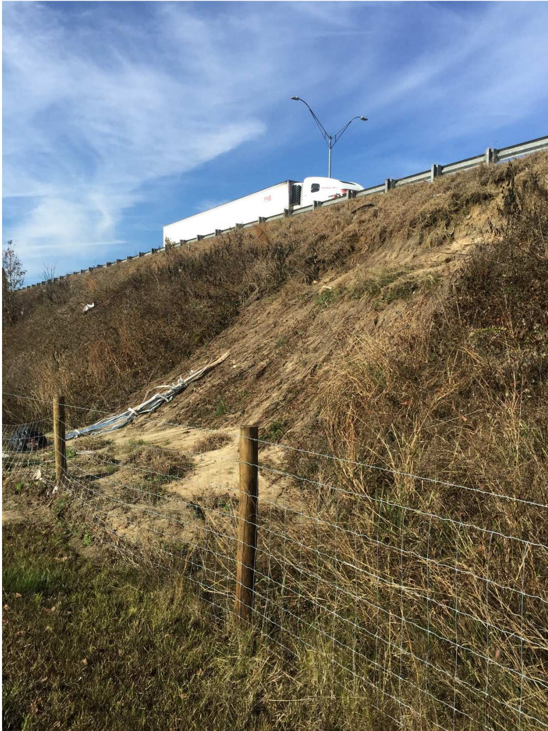
Adjacent to NB lane and Crystal Rd

This site is located adjacent to Crystal Rd. This site consists of rock plating the slope.