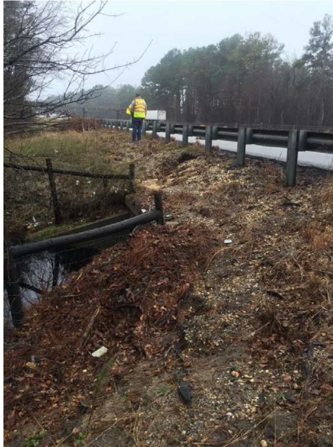
Adjacent to NB lane

This site is located approx. 0.1 miles north of SR 1718. This site consists of debris removal, grading, and patching the paved shoulder. Work will occur on the NB and SB side of the concrete box culvert at this location.