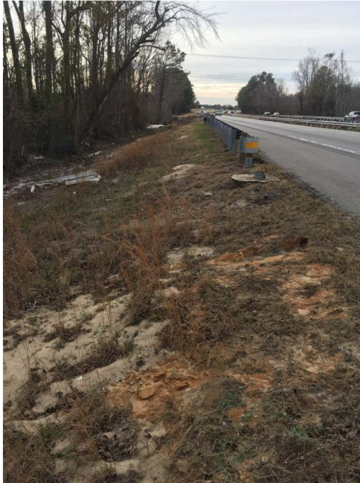
Adjacent to NB lane 0.8 miles north of SR 1726

This site is located north of the bridge located 0.8 miles north of SR 1726 McRaney Rd. The slope will be repaired and the paved shoulder will be patched.