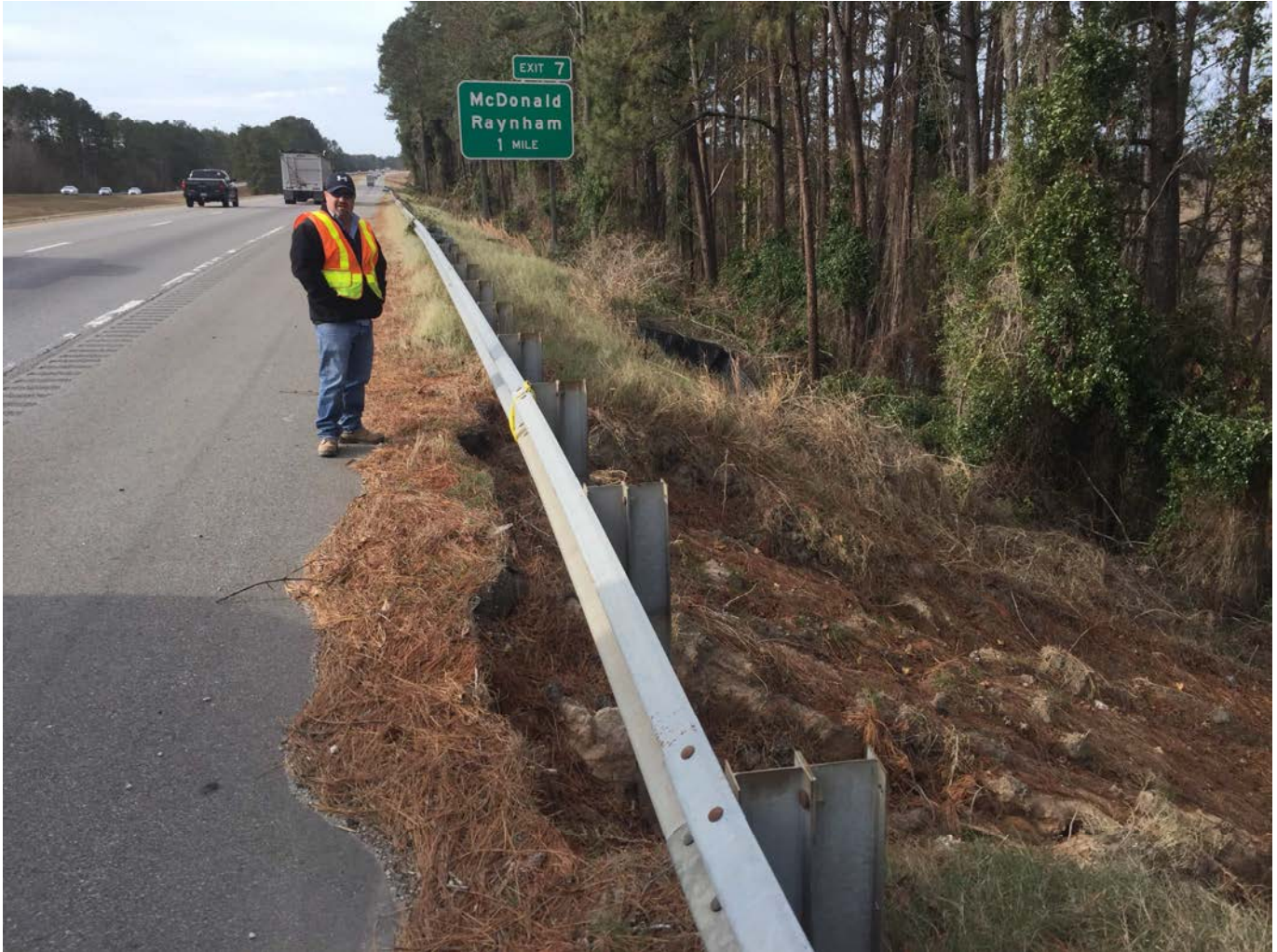
Adjacent to SB lane, north of Exit 71.0 miles, N of SR 2455

The slope of southbound I-95 approx. 1.0 miles north of SR 2455, has washed in two locations. The slope will be rock plated.