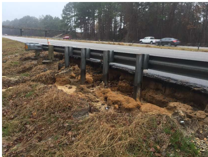
Adjacent to NB lane