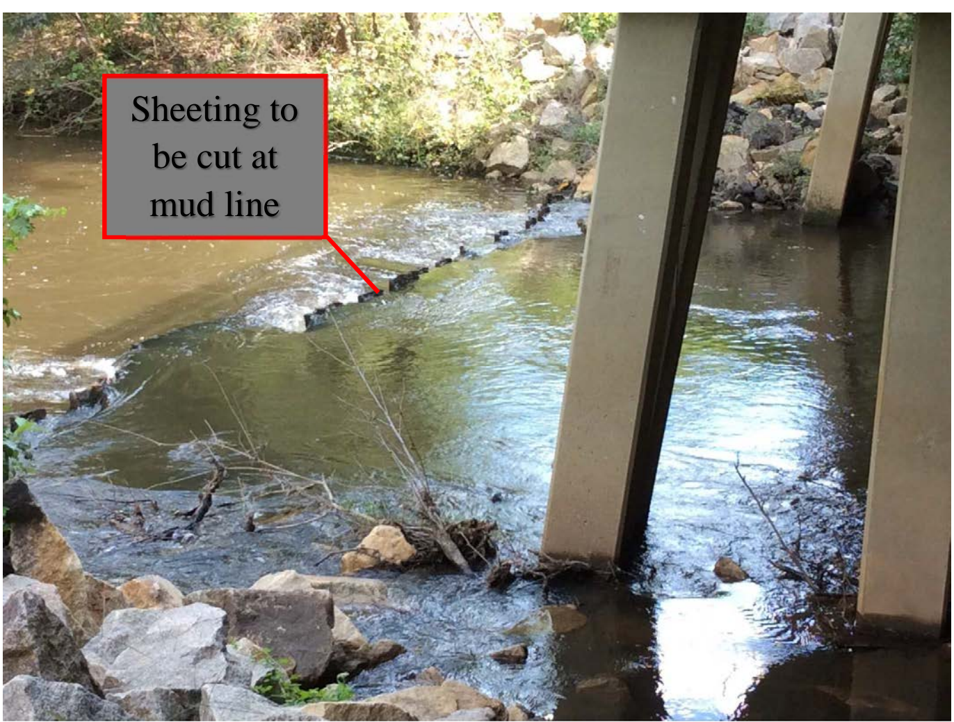
Look at eastern side of Bridge 115. Cut sheeting down to mudline, or remove if you think you can.