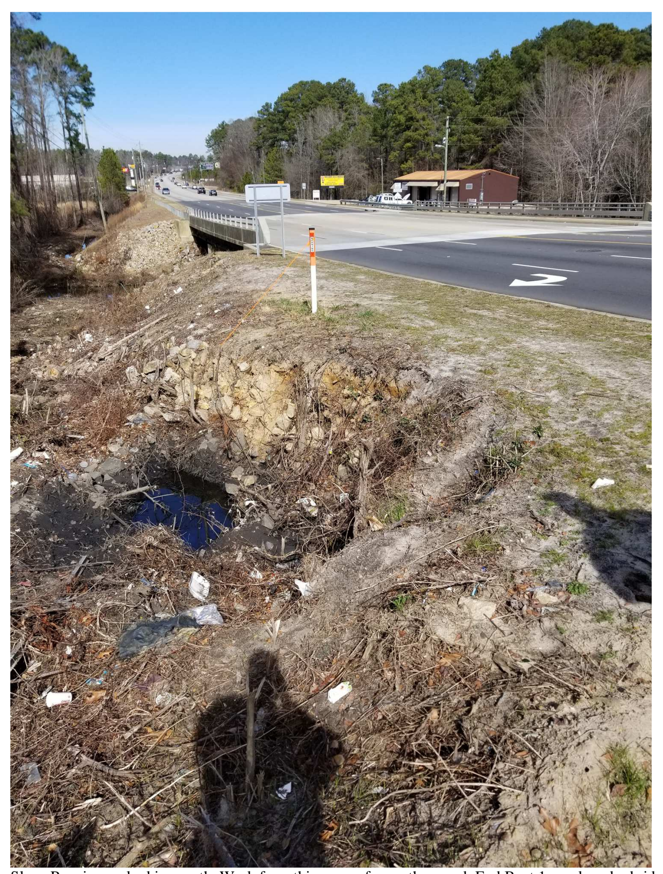
Slope Repair area looking north. Work from this corner for southern end, End Bent 1, work under bridge.