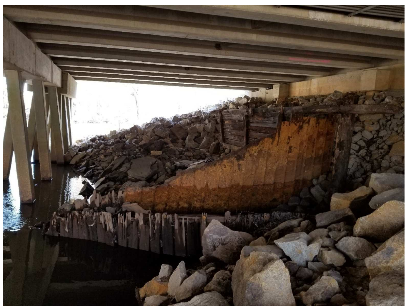
Remnants of old steel sheeting and timber headwall at End Bent 1 to be removed before placing Class II Rip Rap. Lump Sum removal – cutting down as far down as feasible. These remnants contributed to the problem in Hurricane Matthew.