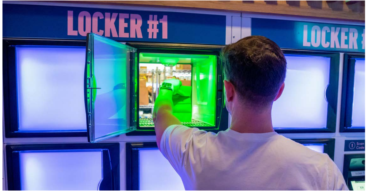
Pandemic-inspired contactless GetREEF Virtual Food Hall at Raleigh-Durham International Airport lets travelers order meals via kiosk or QR code and pick them up from a code-controlled locker.

Airport innovation led the way through the pandemic at the state's commercial service airports when passenger traffic plummeted. Airports expanded no-touch services, social distancing and air filtration to help travelers feel safe and confident flying.