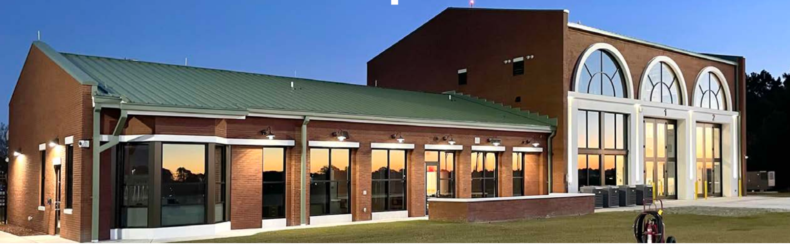
Coastal Carolina Regional Airport in New Bern opened a $5.8 million aircraft rescue and firefighting facility in 2021.