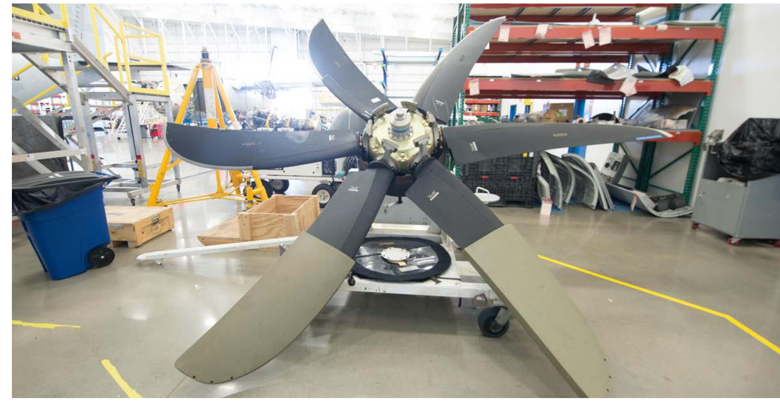
An aircraft propeller undergoes maintenance at the U.S. Coast Guard Aviation Logistics Center at Elizabeth City Regional Airport.

The aircraft maintenance, repair and overhaul, or MRO, industry keeps aviation in the air and contributes more than 8,000 jobs to the state's economy.