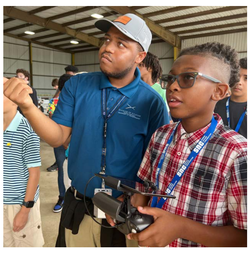
A middle school student learns to fly a drone at a Division of Aviationsupported summer youth camp at Fayetteville Regional Airport.