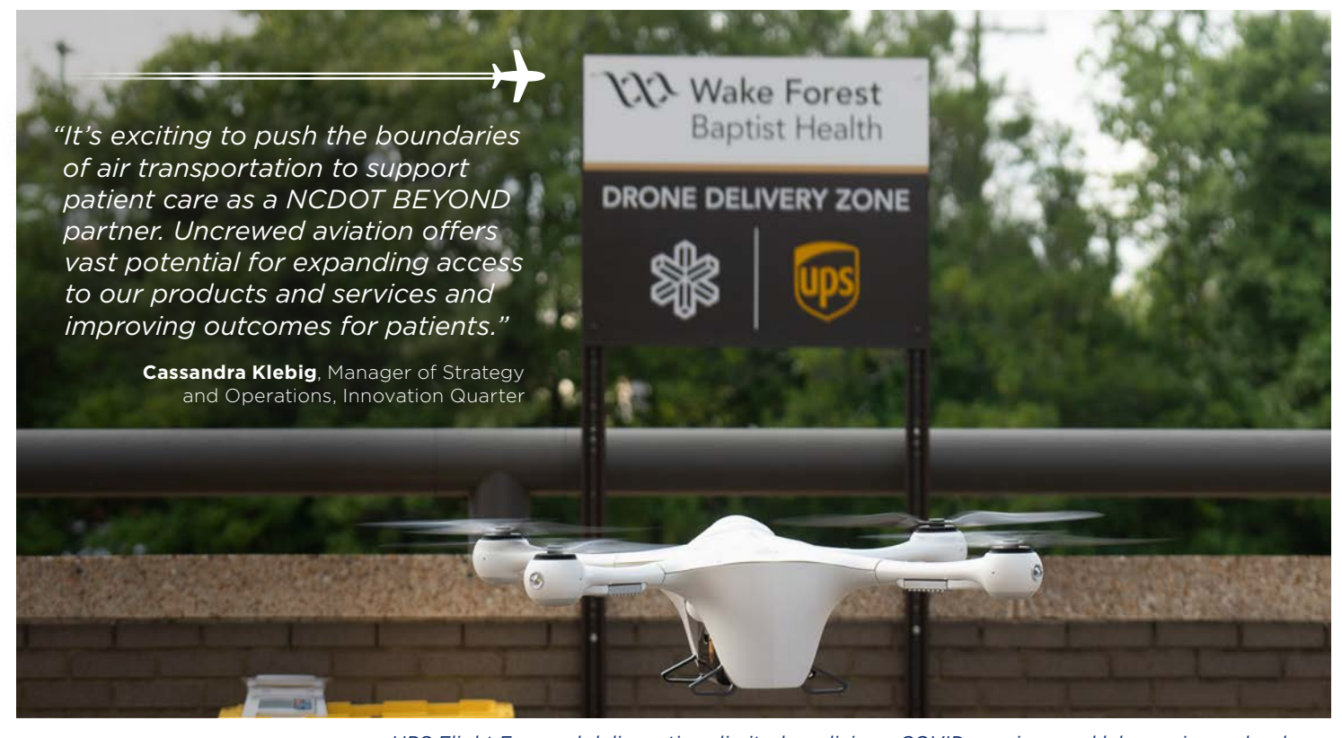
UPS Flight Forward delivers time-limited medicines, COVID vaccines and lab specimens by drone to patients across Atrium Health Wake Forest Baptist's campus in Winston-Salem.

Uncrewed aircraft systems, (UAS, or drones) offer the potential to transform how we live and work but require a complex system of infrastructure and regulation to do so. North Carolina, at the forefront of developing such a system since 2014, continues to achieve significant advances in drone use for business and government purposes.