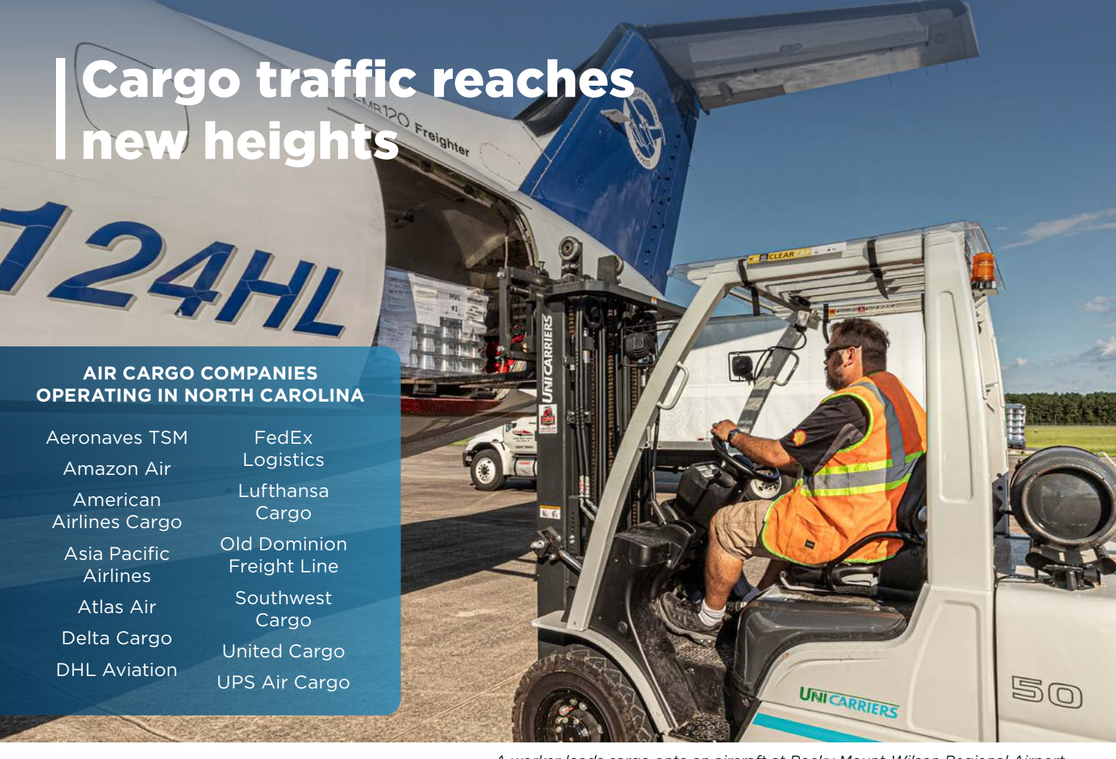
A worker loads cargo onto an aircraft at Rocky Mount-Wilson Regional Airport.

More cargo flowed through North Carolina airports in 2021 than ever before -1.3 million tons, up 22% from 2019 — driven by a major increase in durable good and online purchases by homebound consumers.