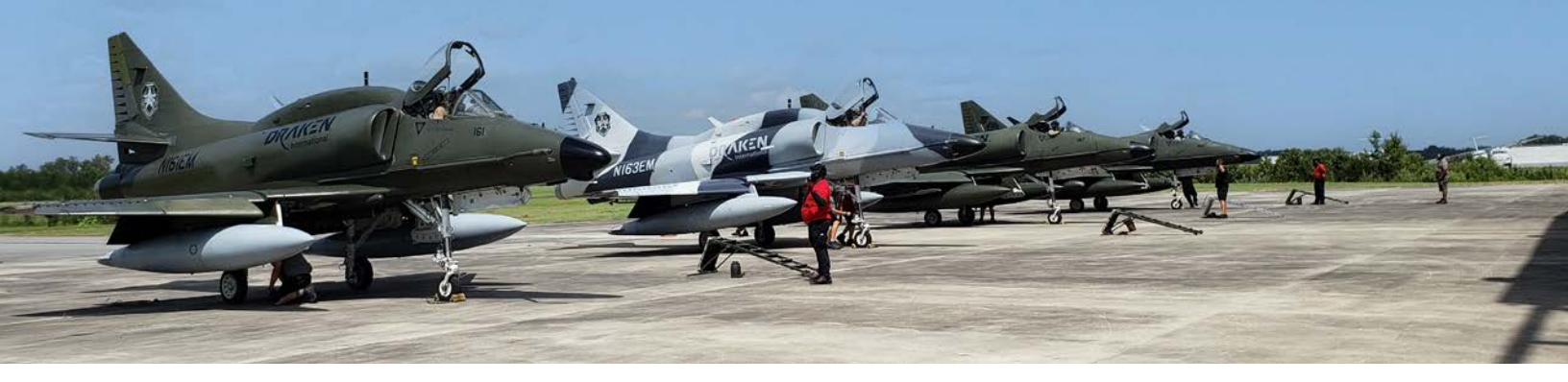
Draken International helps train pilots at nearby military bases from its facility at the North Carolina Global TransPark in Kinston.