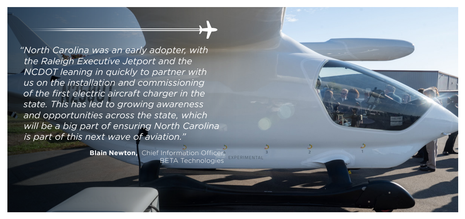
BETA's ALIA conventional takeoff and landing electric aircraft awaiting charging at Raleigh Executive Jetport in Sanford.

North Carolina took a step toward sustainable aviation in October 2023 with groundbreaking at Raleigh Executive Jetport in Sanford for the first two electric aircraft chargers to be installed in the state. Electric chargers designed by BETA Technologies charge electric aircraft, cars and trucks. The installation set the stage for electrifying aviation statewide once electric aircraft are cleared by the Federal Aviation Administration for routine commercial flight.