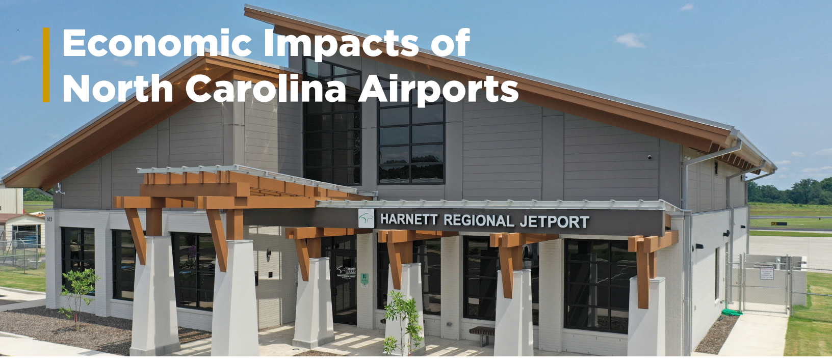
Harnett Regional Jetport unveiled its new 7,000-square-foot state-of-the art terminal building in June 2024. It provides a modern, comfortable, convenient space for travelers and crew.