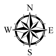
FIGURE 1 Sheet 4 of 5