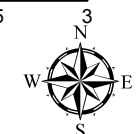
Figure 1, Sheet 2 of 5