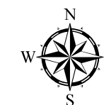
FIGURE 1 Sheet 5 of 5

Base map date: January 14, 2016 Refer to CTP document for more details