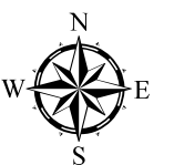
FIGURE 1 Sheet 5A of 5

Base map date: January 14, 2016 Refer to CTP document for more details