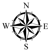
Figure 1 Sheet 5 of 5