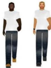
Figure 2.0: Worker Characters with White T-Shirts