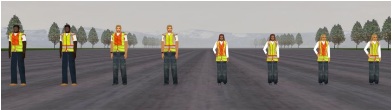
Figure 1.0: Worker Characters with Donned Vests