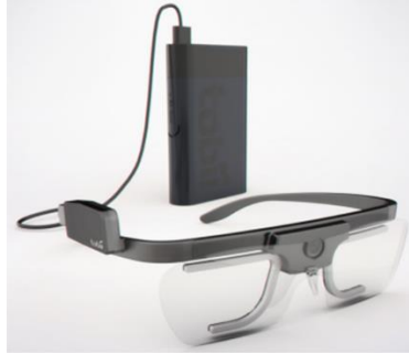
Figure 5.0: Tobii Pro Glasses 2 Head and Recording Unit