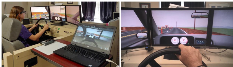
Figure 4.0: Trans-Sit Simulator and Driver View with Gaze Point

The Trans-Sit simulator used in this study was manufactured by Advanced Therapy Products and is a 48-by-60-in. mock-up of a car with a moveable steering wheel, functional doors, handles, locks, seat belts, moveable seats, a gas pedal, and a brake pedal (Advanced Therapy Products, 2014). It has been fitted with three 27" LCD screens that portray animated images of an on-road environment. The simulator software, STISIM Drive (Systems Technology, n.d.), has demonstrated accessibility and transferability between simulator and on-road performance (Lee et al., 2006; Shechtman et al., 2009). Box fans were positioned in front of the participant to blow cool air across the simulator body to reduce the ambient temperature and help with participant comfort. The Trans-Sit simulator can be seen in Figure 4.0 below.