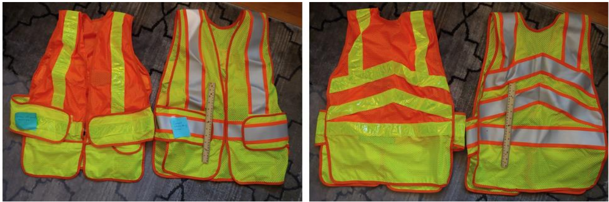
Figure 3.0: Front and Back view of Orange (Left) and Yellow (Right) Safety Vests.