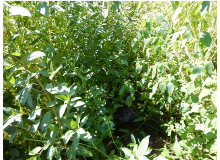
PP #2 Downstream