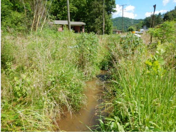
PP #1 Upstream