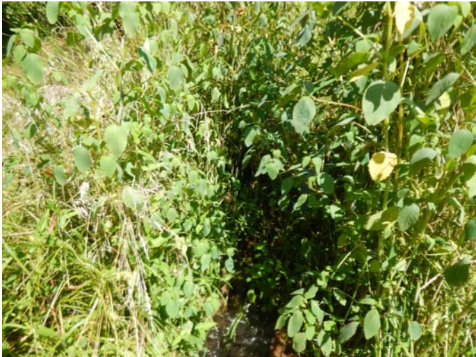
PP #2 Upstream