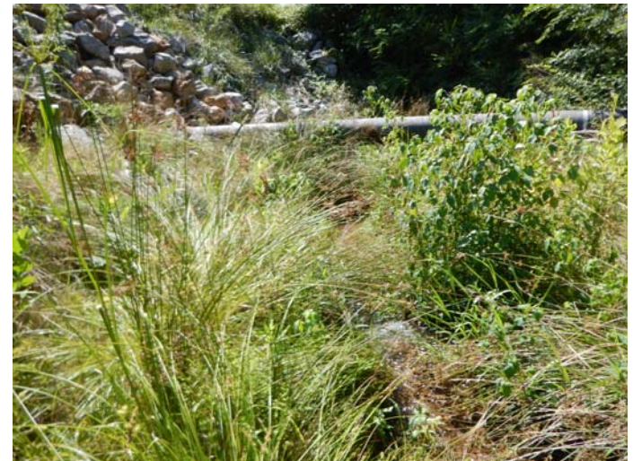
PP #3 Downstream