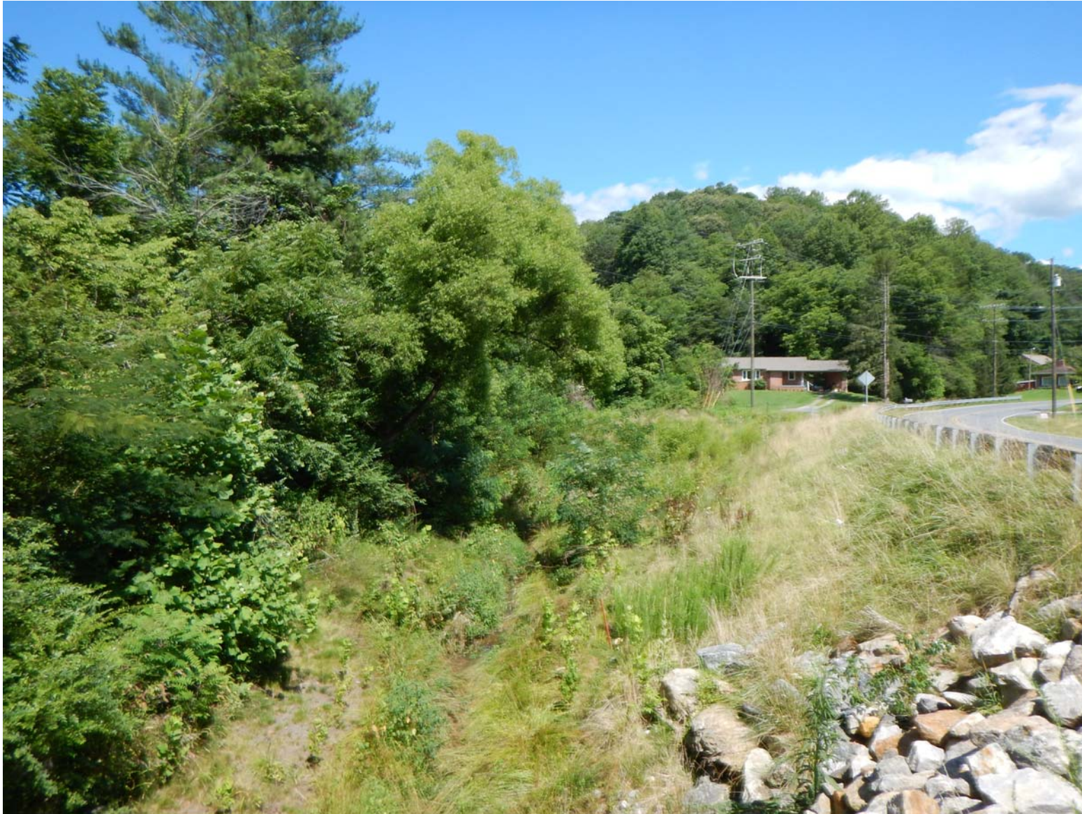
Overview photo looking upstream