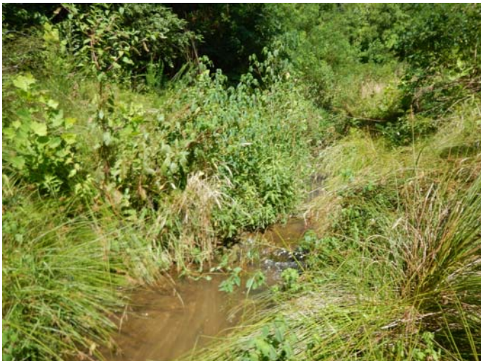
PP #3 Upstream