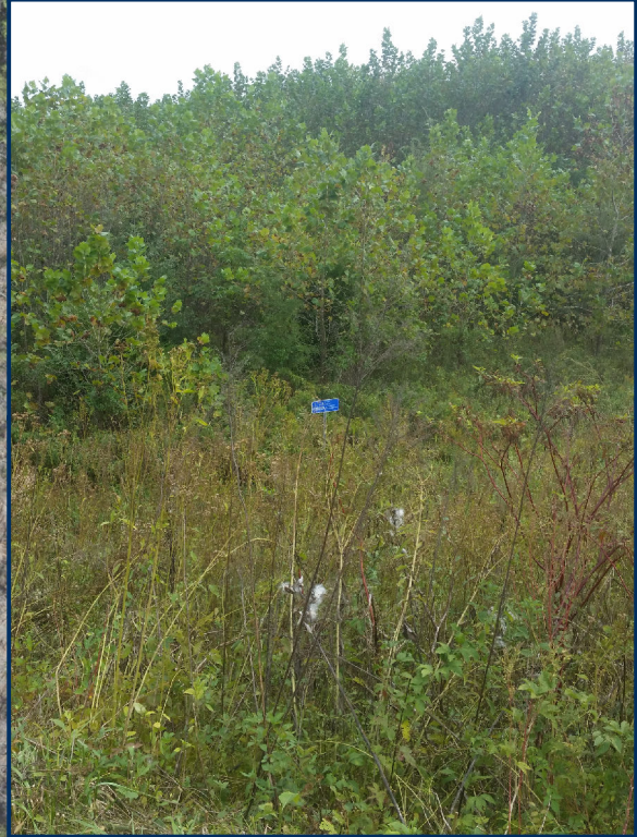
1 - Site Overview