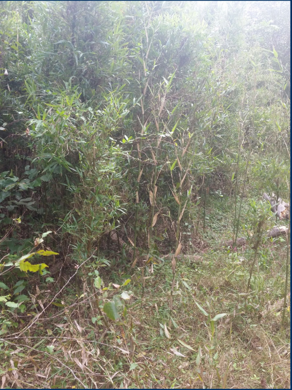
3 - Bamboo