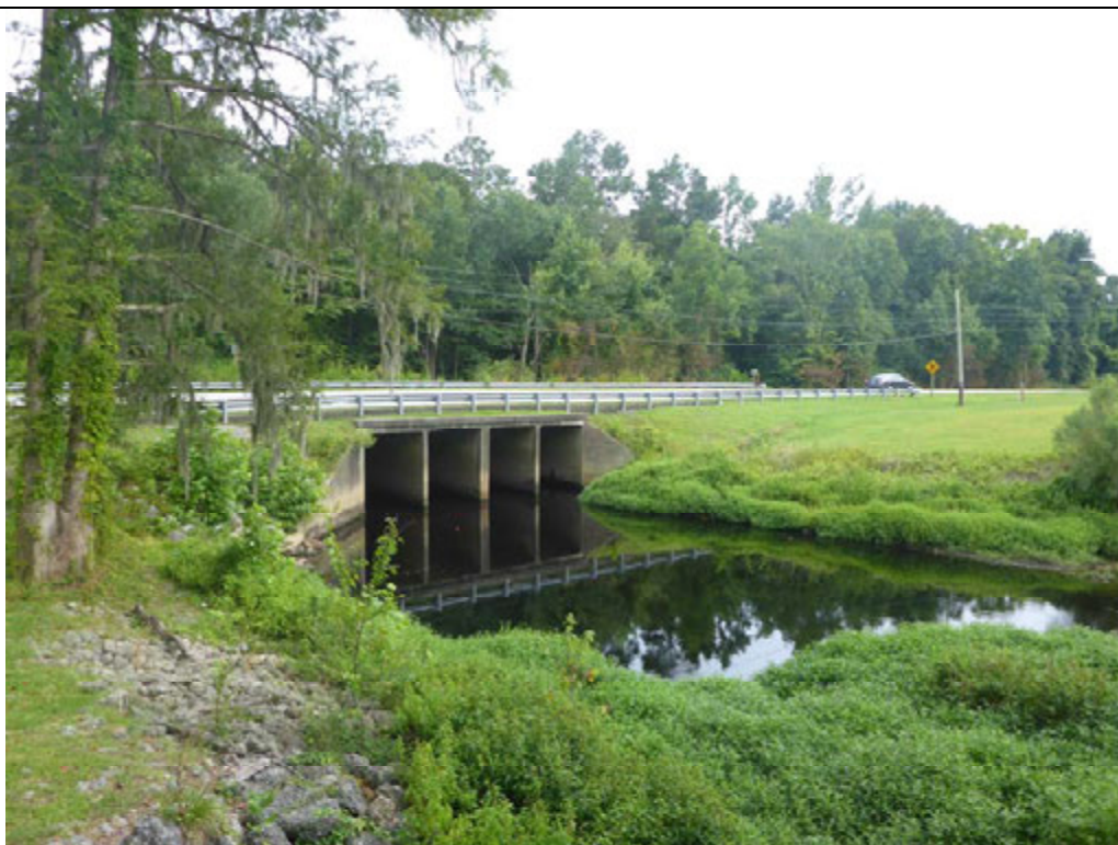
Photo 5 – The eastern limits of the site where Crooked Run crosses under NC 58.