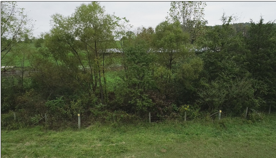
Photo 8 – View of fence intact with easement markers present and visible.