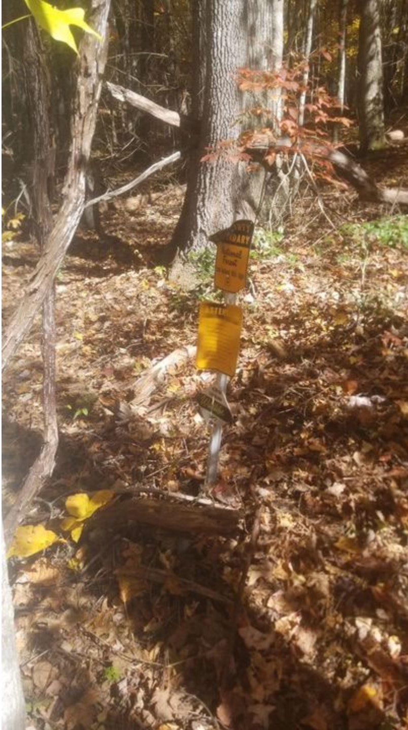
Image #1: Property boundary marker near the northern end of the site