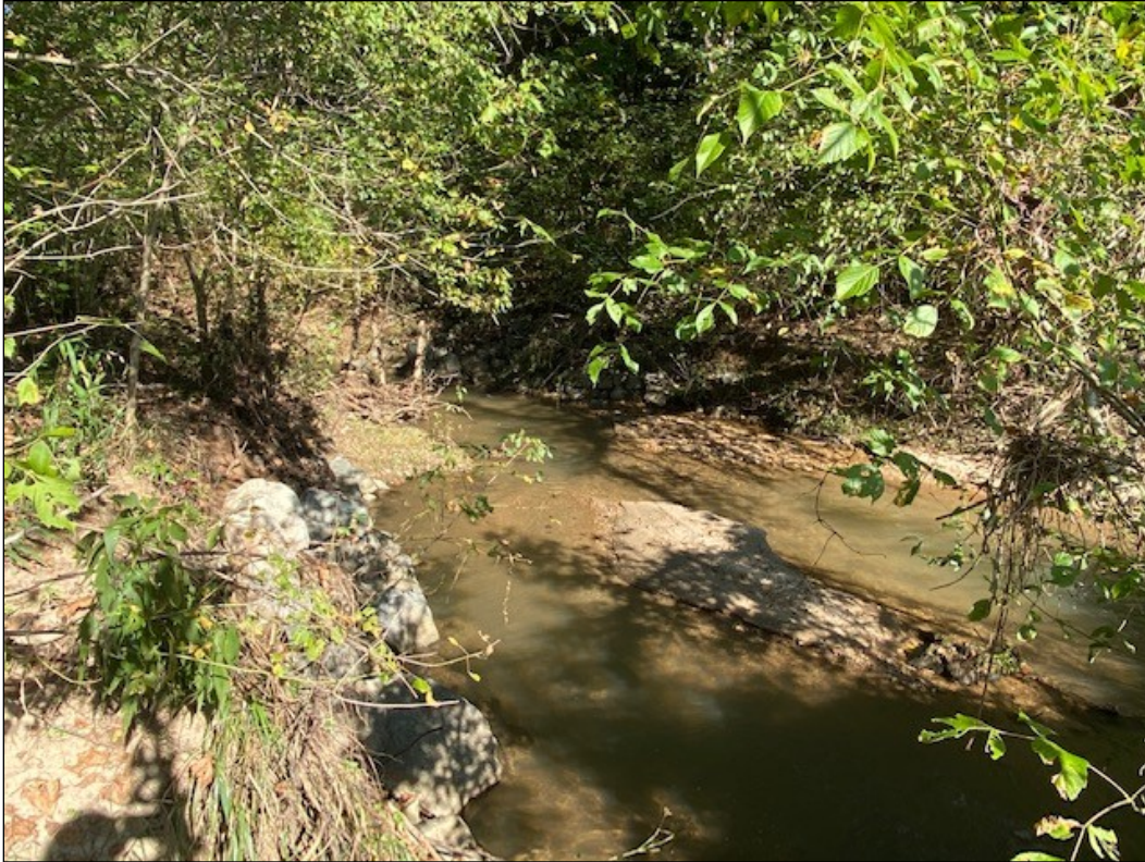
Photo 2 – View of interior of site from north side of Propst Road.