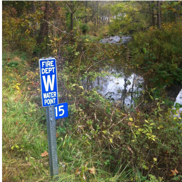
A watering point for the fire department is located on the west side of the site off of Beech Glen Road