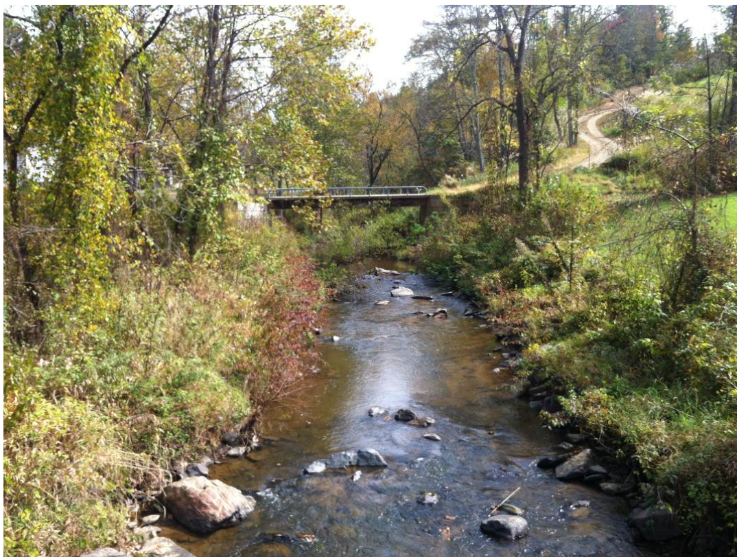
Facing upstream at northeastern road crossing