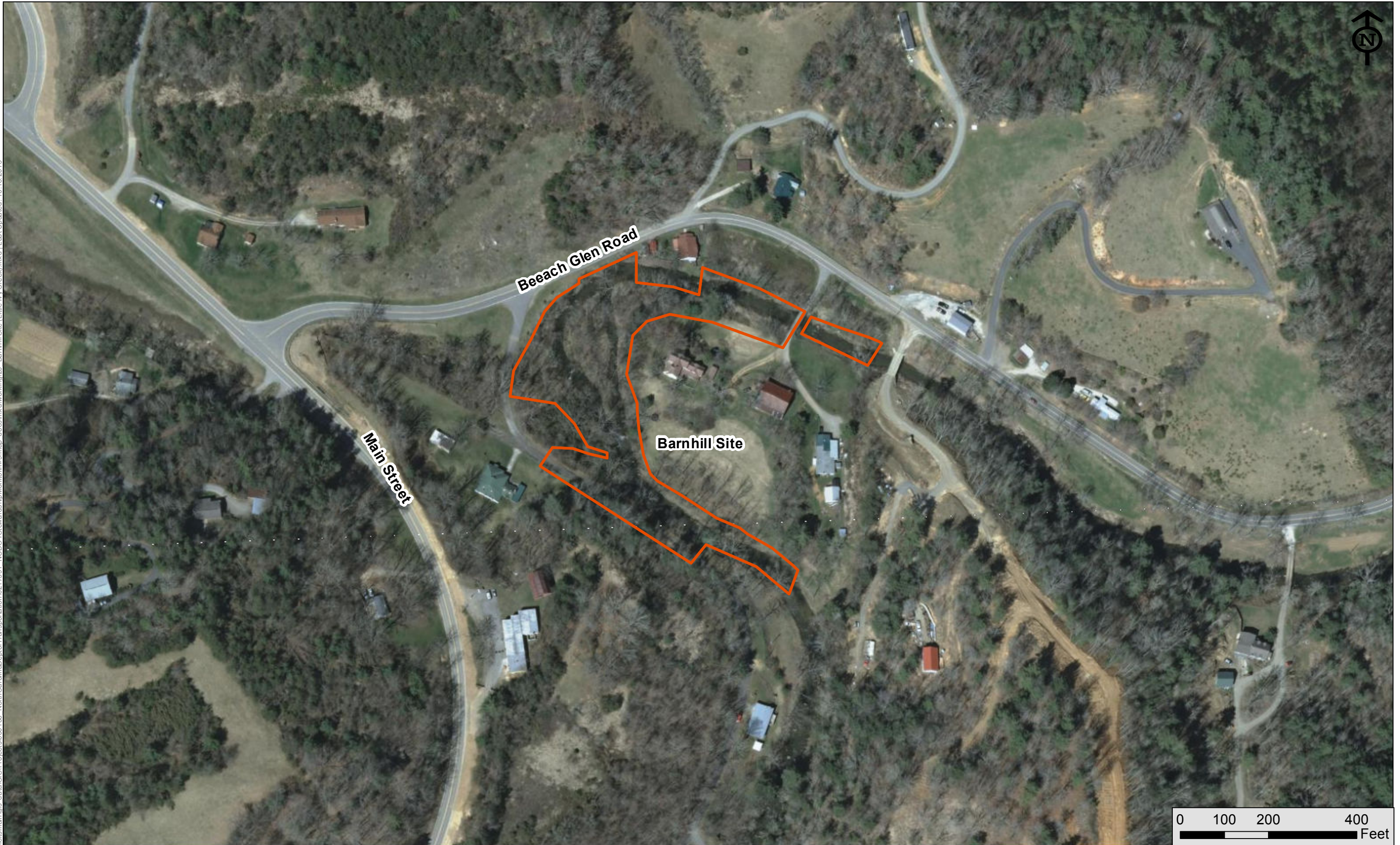
Little Ivy Creek, Barnhill Site

\\nctsmain\gis_data\GIS\Projects\000166_NorthCarolinaDeptofTransportation\0217597_NCDOTStewardshipMonitoring\#9\map_docs\mxdlworking\20_BarnhillSite_LittleIvyCreek.mxd | Last Updated: 10/18/2013