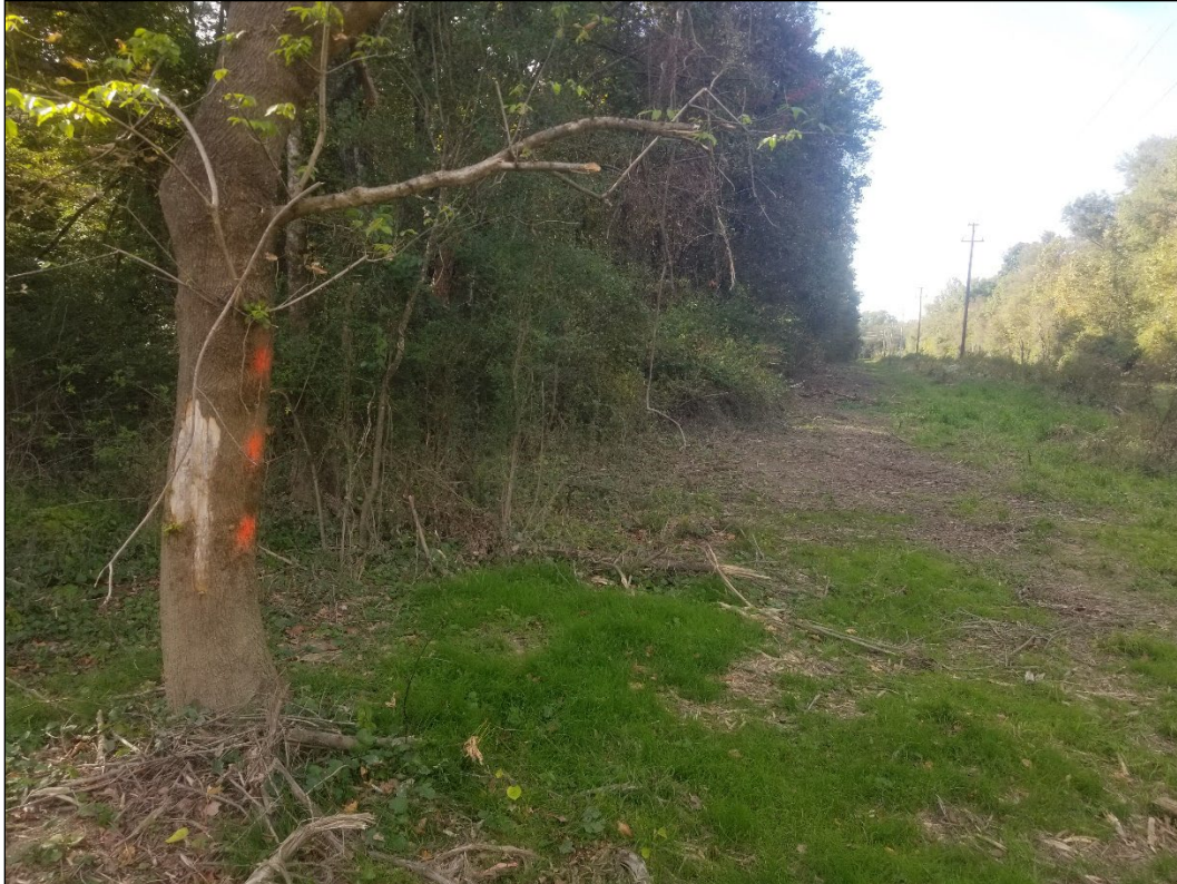
Photo 4 – Site boundary along the powerline easement. Trees were marked with orange along this boundary to ensure that clearing did not enter the site