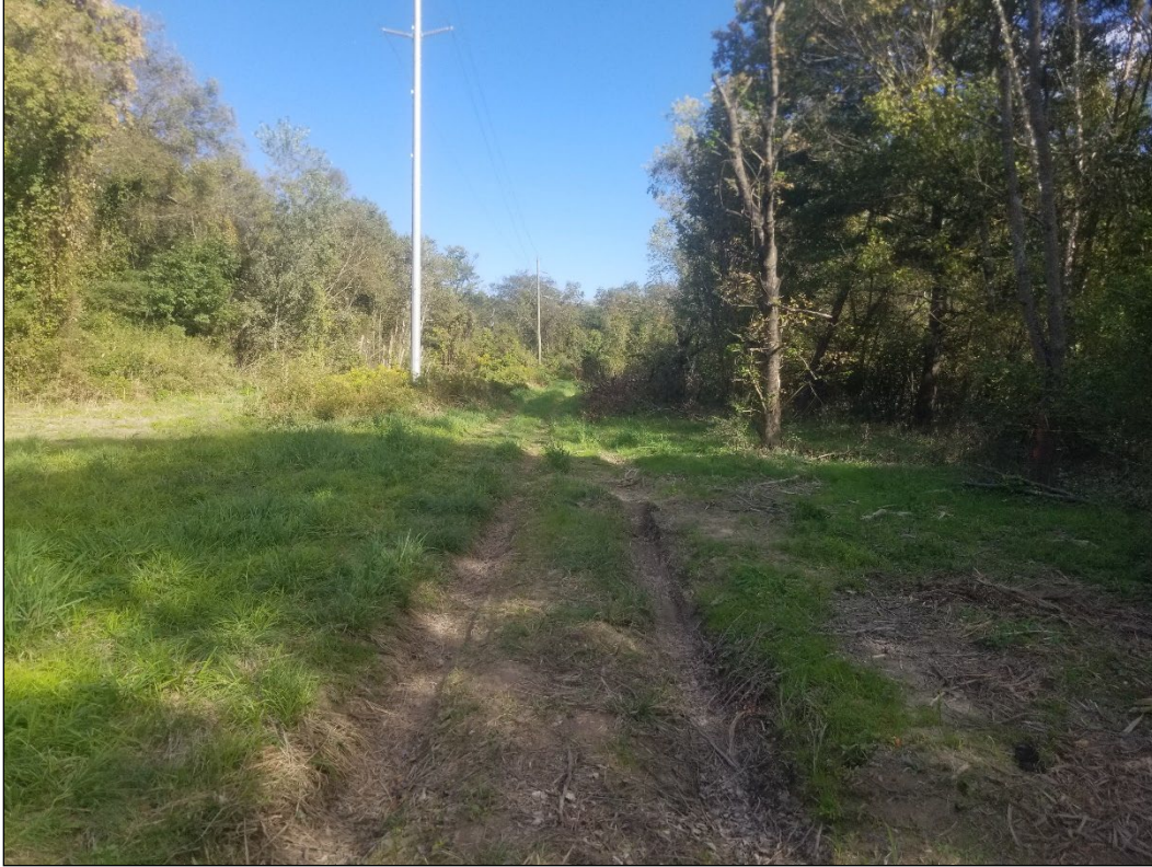
Photo 3 – Interior of site under the powerline easement where there has been recent clearing.