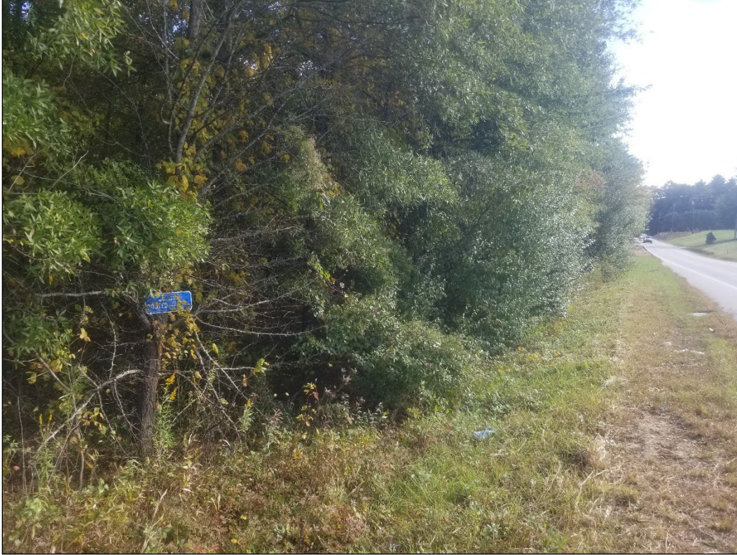
Photo 1 – View into site from Brookside Camp Road with NCDOT signage present and visible.