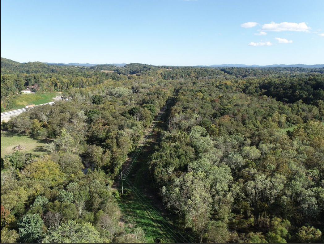
Photo 5 – Aerial view of the site looking south down the power line easement.