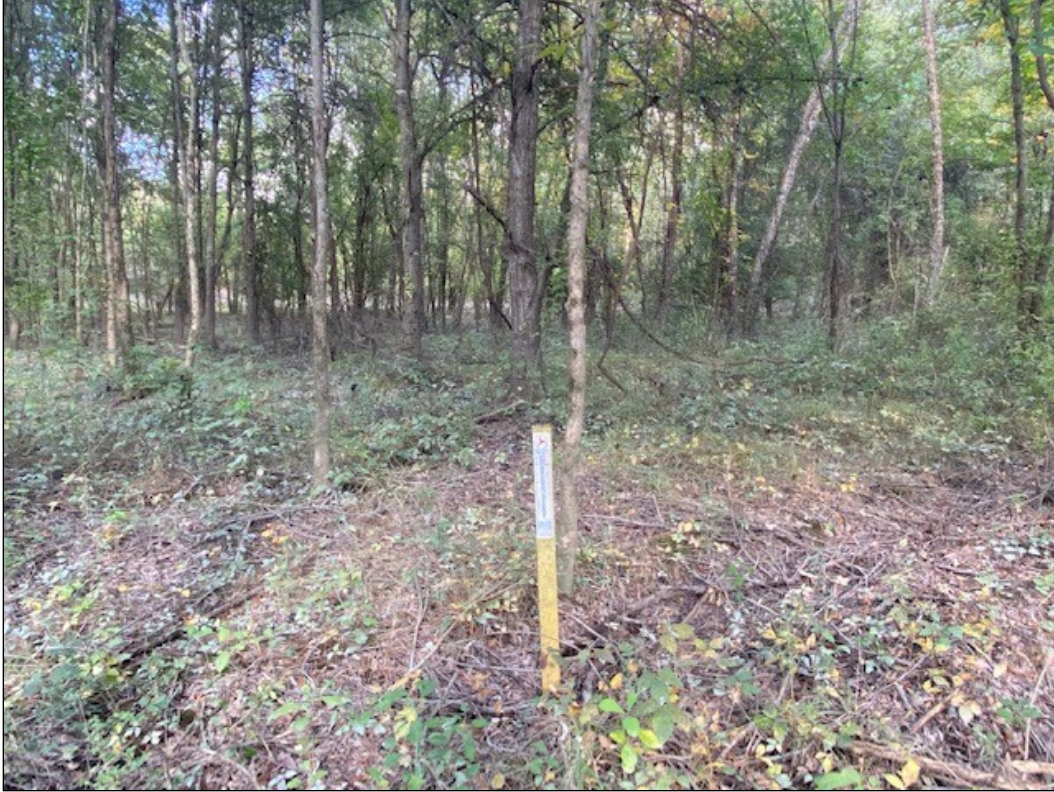
Photo 3 – Interior of site with NCDOT boundary markers present and visible.