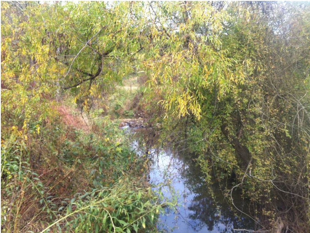
Facing west and upstream at Angel Road, view of Paint Fork Creek