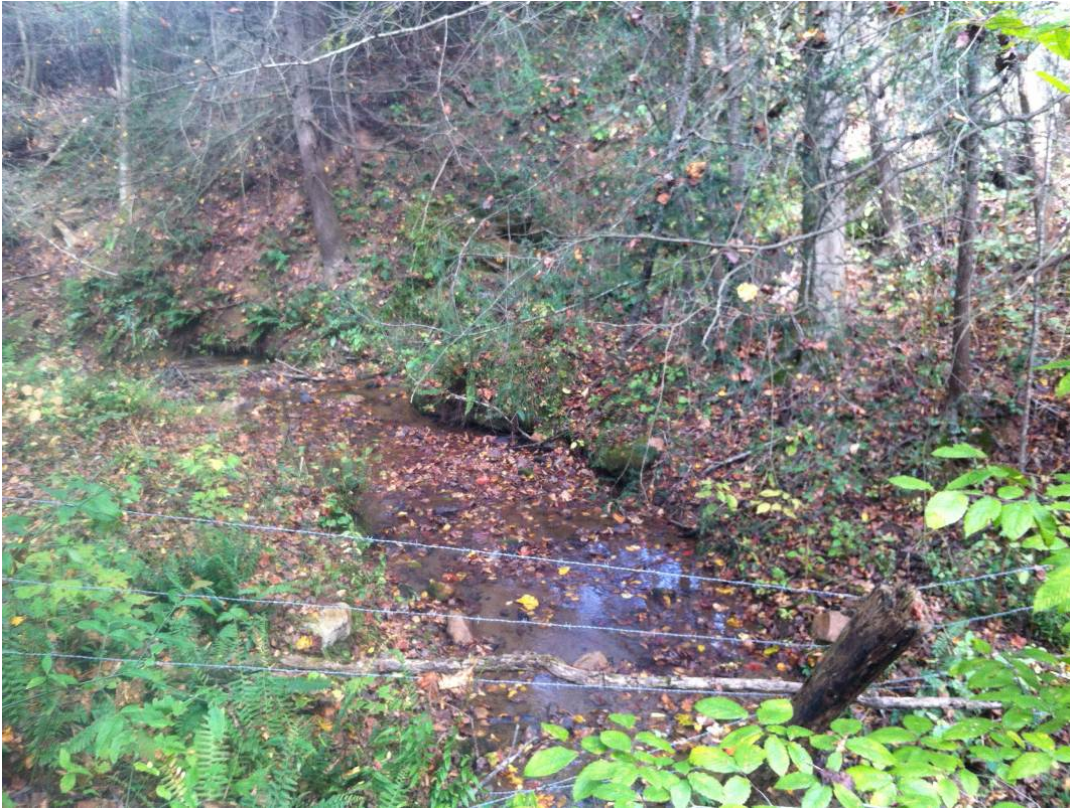
Facing downstream and north at southern crossing of tributary to Paint Fork Creek at Angel Road