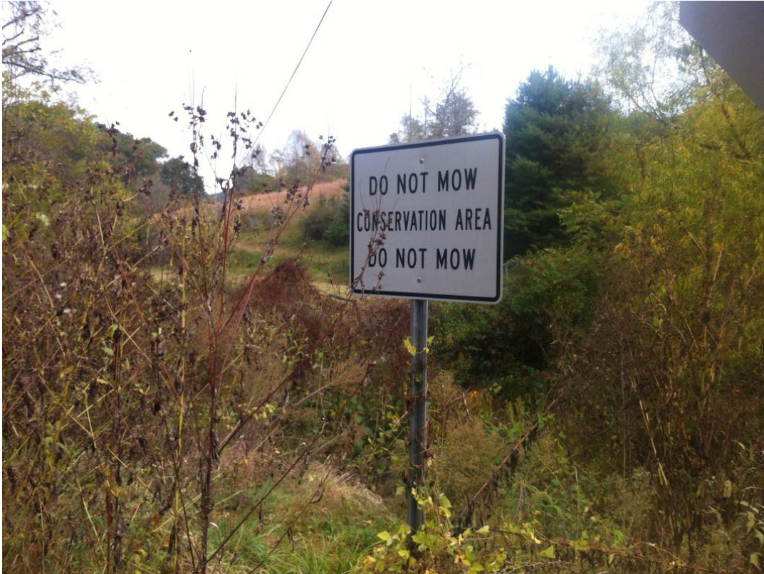
Sign posted at Angel Road crossing of Paint Fork Creek