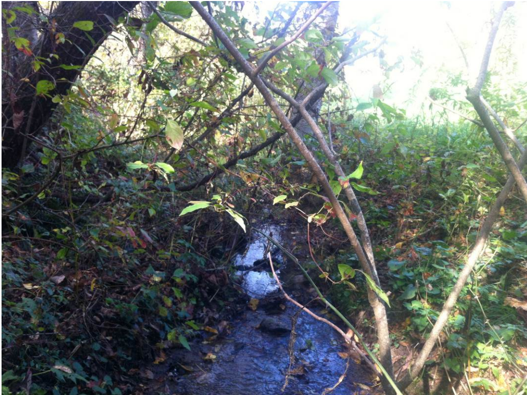
Facing upstream from small tributary feeding into Paint Fork Creek at eastern area of site