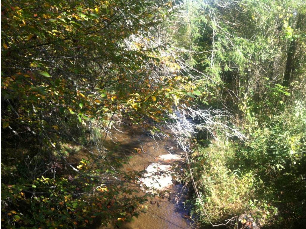
Facing upstream and west from Backhollow Road, at beginning of site