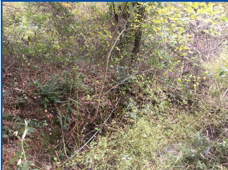
3 - Potential Violation