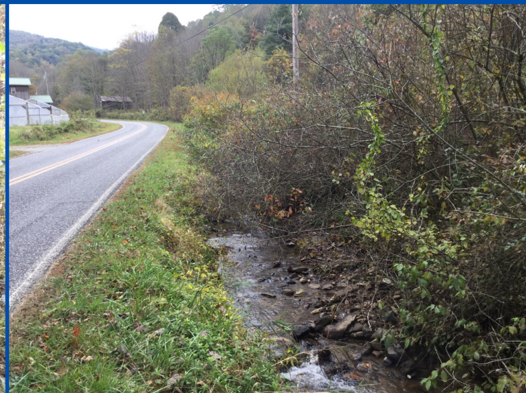
4 - Site View