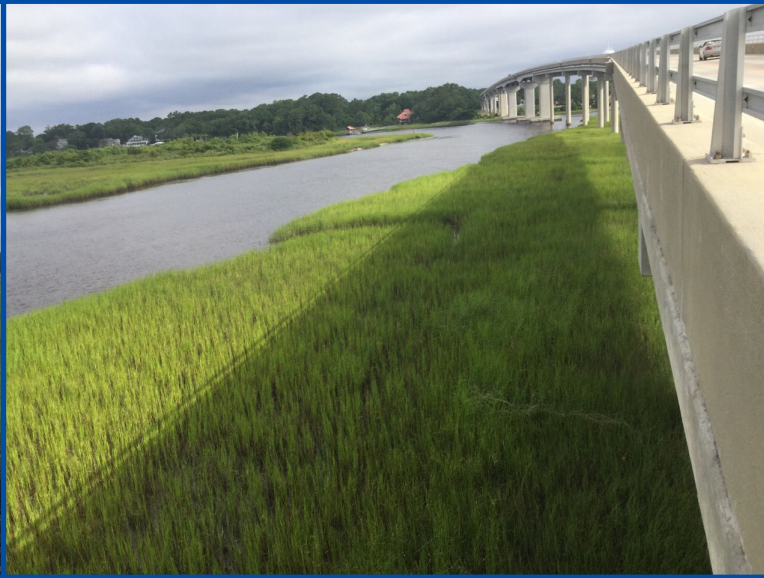
4 - Site View