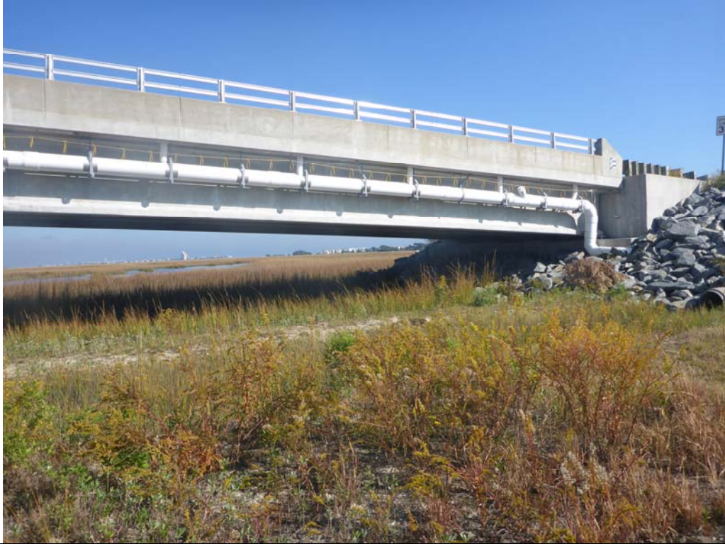
Photo 1 – Looking east towards the south end of Sunset Beach Bridge.