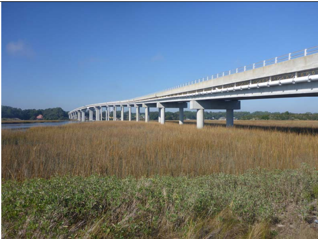
Photo 2 – Looking north from the southern end of Sunset Beach Bridge.