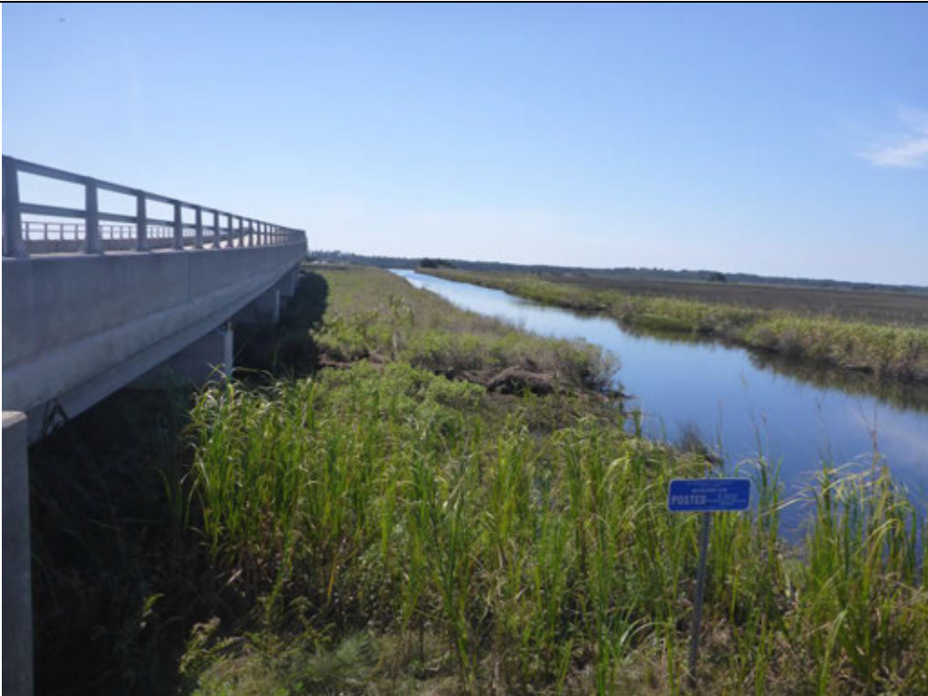
Photo 4 – View of the mitigation area north of Thorofare Bay and west of the bridge.