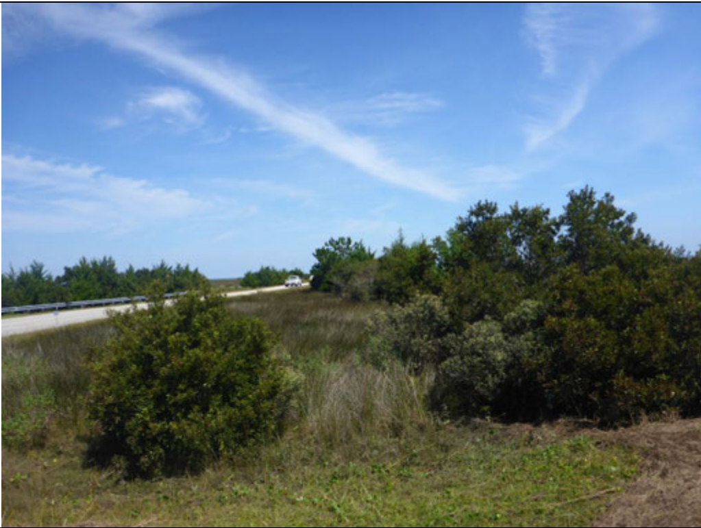
Photo 2 – View of the mitigation area north of the dock entrance road.