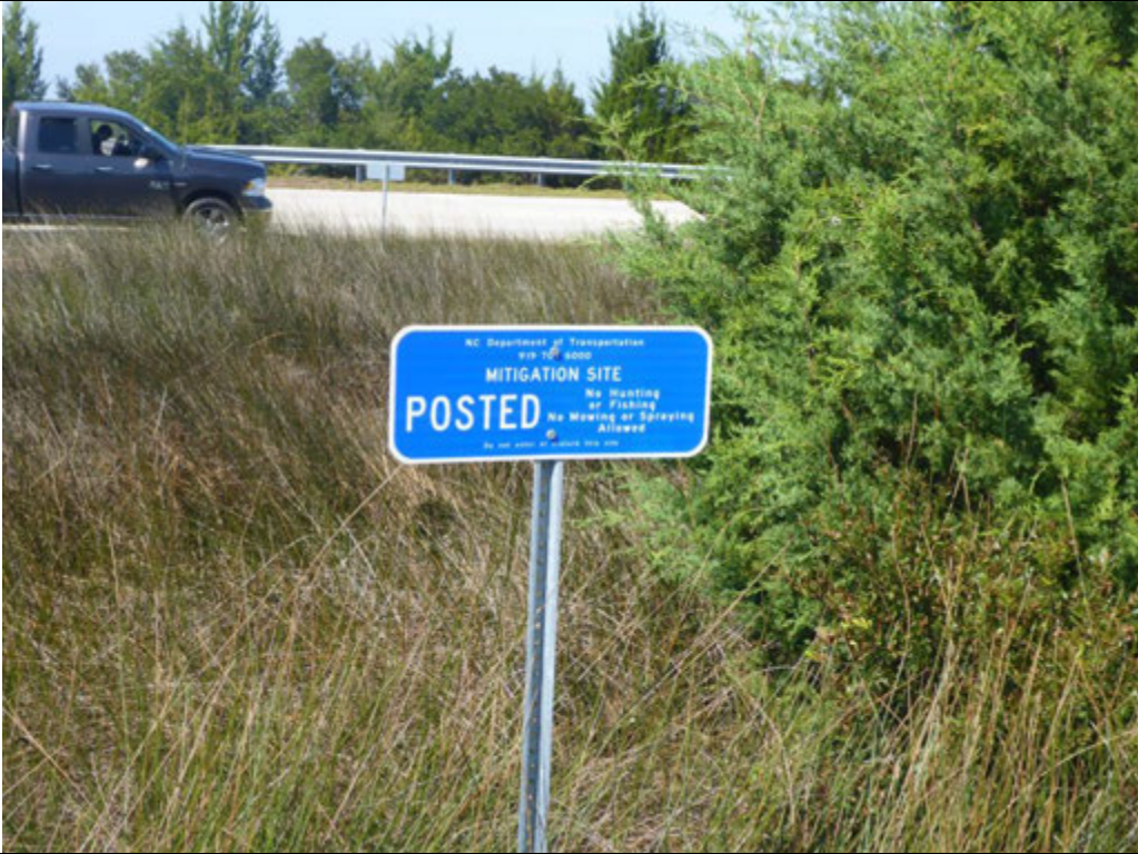
Photo 1 – NCDOT “Mitigation Site” signage was observed around the site.