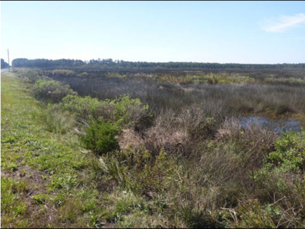
Photo 3 – View of the mitigation area south of the dock entrance road.