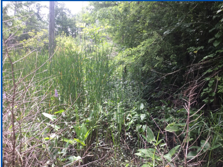
3 - Boundary Condition