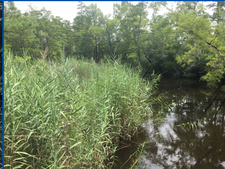
4 - Site View