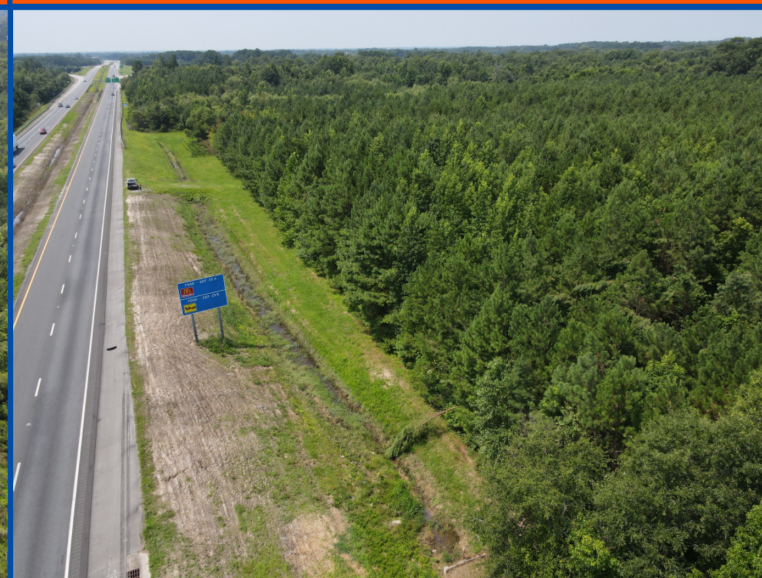
4 - Boundary Condition