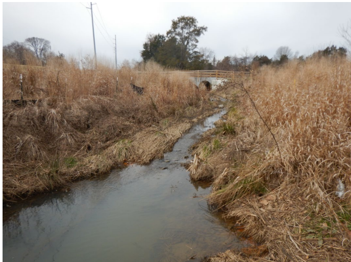
PP #1 Upstream