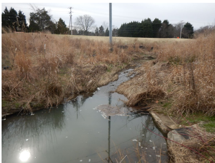
PP #2 Upstream