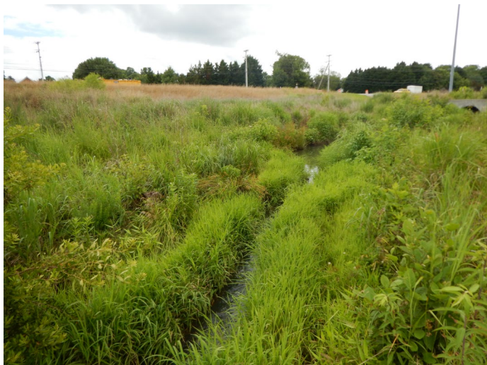
PP #3 Upstream