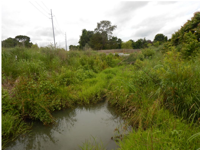
PP #1 Upstream