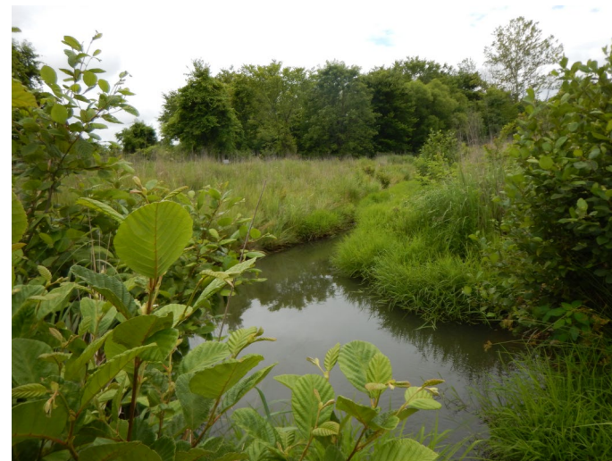
PP #3 Downstream