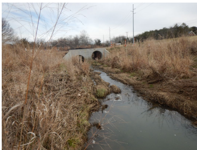
PP #2 Downstream