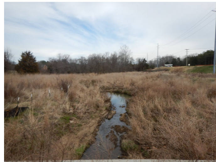
Overview photo looking downstream from driveway pipe