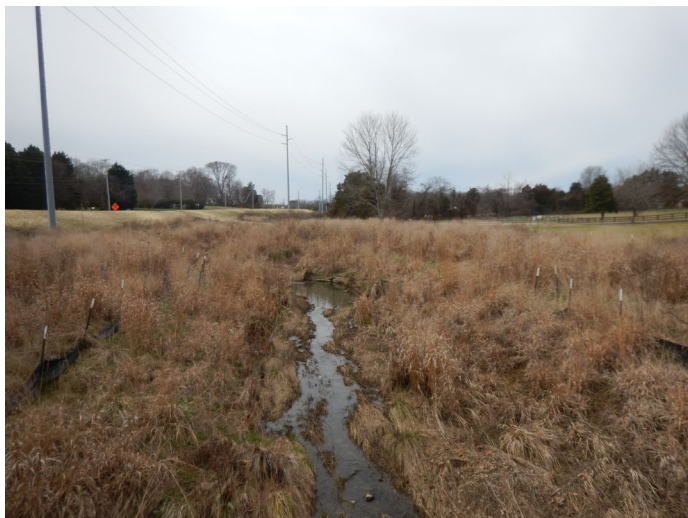
Overview photo looking upstream from driveway pipe