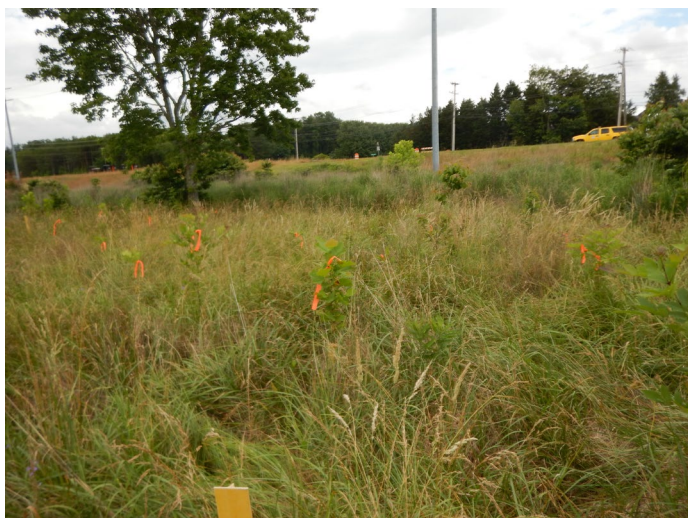
Vegetation Plot #1