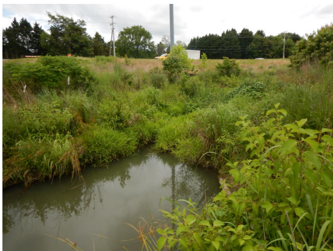
PP #2 Upstream