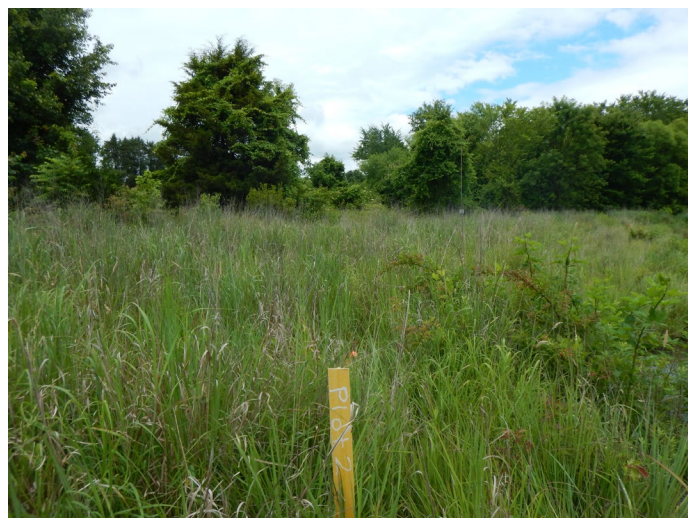
Vegetation Plot #2