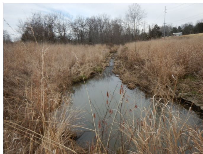
PP #3 Downstream