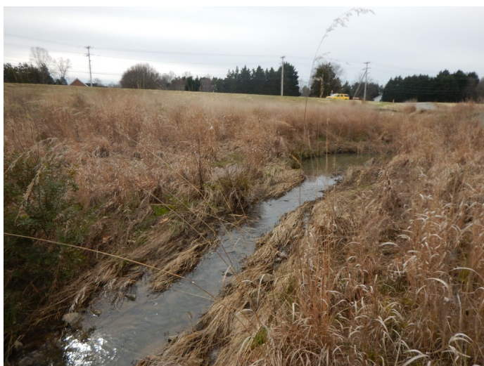
PP #3 Upstream