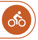
Bicycle and Pedestrian