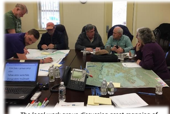
The local work group discussing asset mapping of current outdoor recreation opportunities in Graham County.