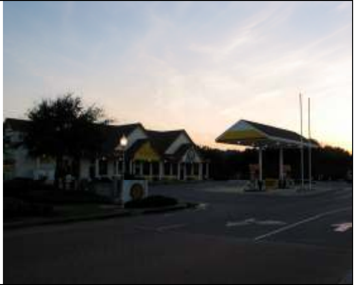
Site 13: Brew Thru