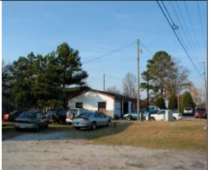
Site 1: 7-Eleven