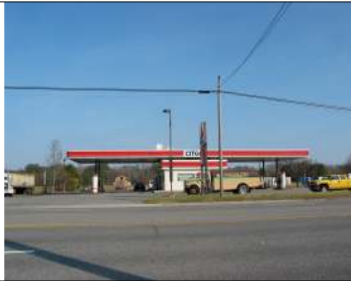
Site 7: Citgo (Coinjock Amoco)