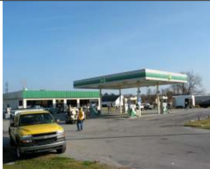
Site 5: Nancy's Mini Mart