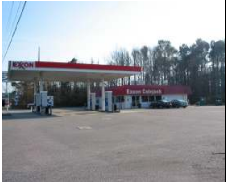
Site 3: Currituck Sports.