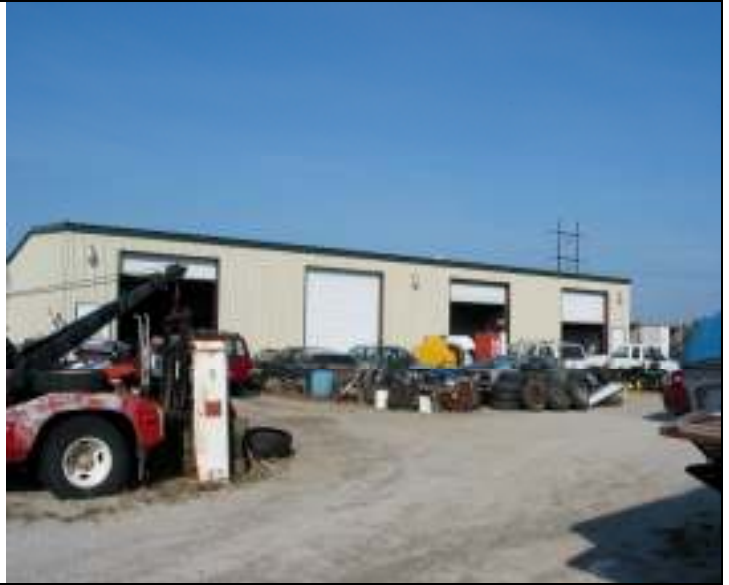
Site 9: Coinjock Automotive