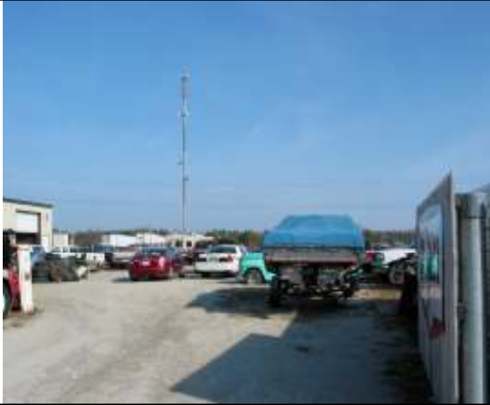
Site 9: Coinjock Automotive