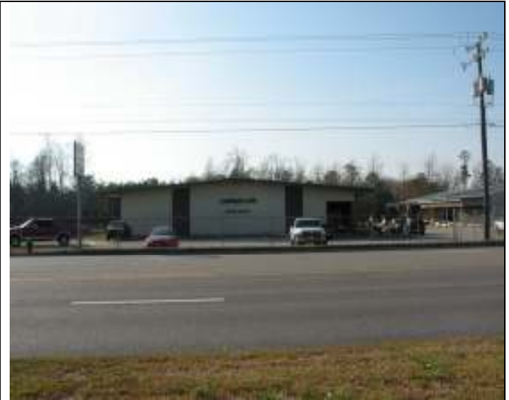
Site 6: J. I. Hayman Hardware