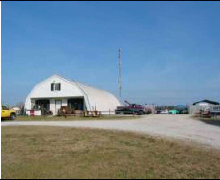
Site 9: Coinjock Automotive