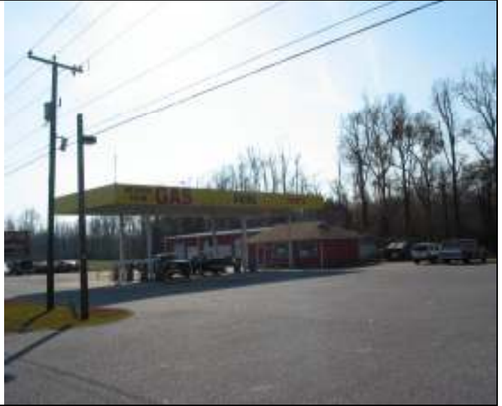
Site 10: Henry's