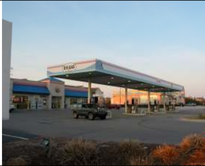
Site 12: OB Gas