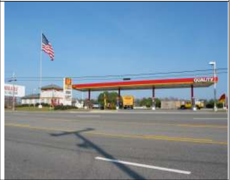
Site 8: Coinjock Gas House