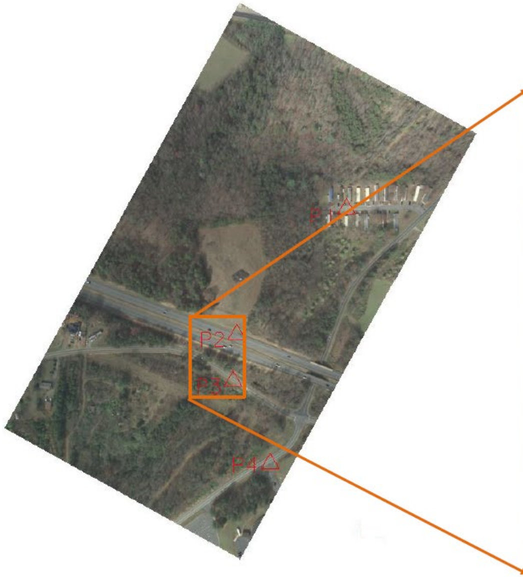
Panel – ground surveyed photo control point