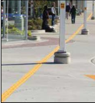
Directional Bar Tiles used to delineate between pedestrian and traffic zones

Directional Bar Tiles are manufactured by ADA Solutions, Inc. out of Wilmington, Massachusetts. It is currently listed as under evaluation on the Approved Products List (APL) as NP21-8847. Directional Bar tiles are thin surfaced paver products applied to concrete pedestrian facilities. They function as a tactile wayfinding product that provides directional assistance to visually impaired pedestrians in areas where an easily identifiable walking path may otherwise not be readily apparent. The Bar Tiles can be cast-in-place (wet-set) into the concrete surface, or surface mounted on existing concrete. The tiles feature raised bars 1.3 inches wide, 11 inches long, and spaced 3 inches on center. For more information, please visit: