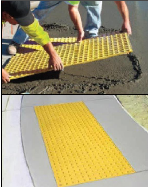
Workers placing an Equal Tile Paver in freshly poured concrete (top), an Equal Tile Paver in finished concrete (bottom) – images from Equal Tile brochure

The Equal Tile Cast-In-Place Paver is manufactured by Advanced Roadway Manufacturing, Inc. out of Orlando, Florida. It is currently approved for use and listed on the Approved Products List (APL) as NP22-9056. The Equal Tile Cast-In-Place Paver is an ADA Detectable Waring Device primarily used for curb ramps near crosswalks. Each Equal Tile Paver has eight, 1.5-inch long metal anchors threaded through it so that the paver embeds into the fresh concrete for enhanced attachment. It is available in a variety of shapes and 10 different colors. For more information, please visit: