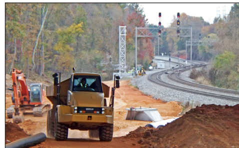
I-2304 AE Duke Curve Realignment