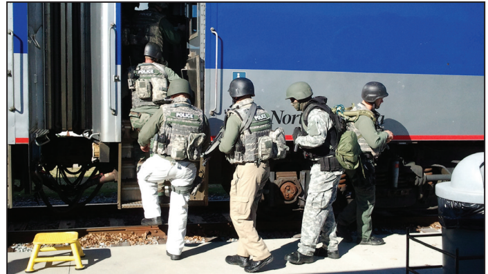
Police/First Responder Training at NCDOT Capital Yard

Ridership on Piedmont trains 73, 74, 75 and 76 was 14,938 and 8,914 on Carolinian trains 79 and 80 for the period of December 20 –29, 2013.