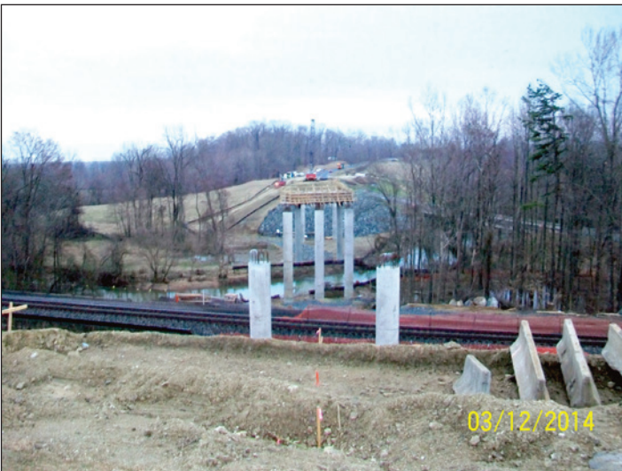
C-4901 Turner Road - Overpass Substructure