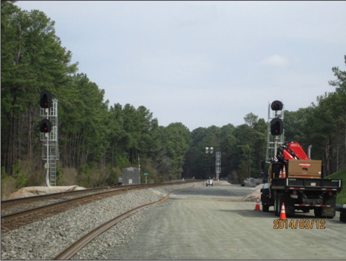
U-4716 Hopson Rd./Nelson-Clegg - Signal work