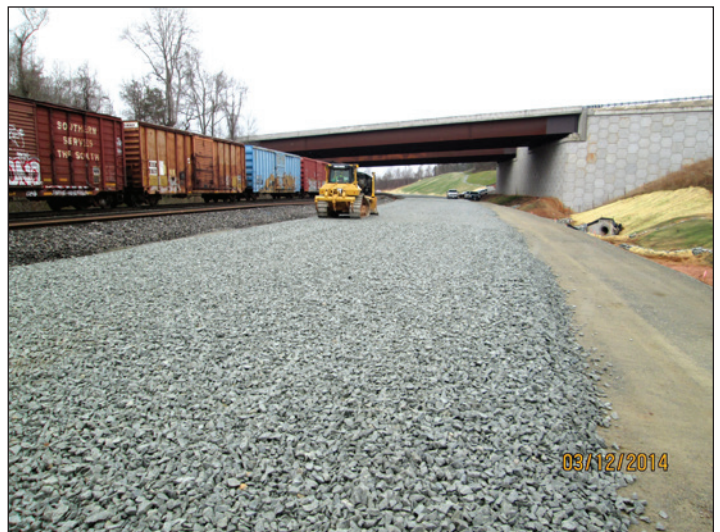
I-2304 Duke Curve Realignment - Ballast Pad