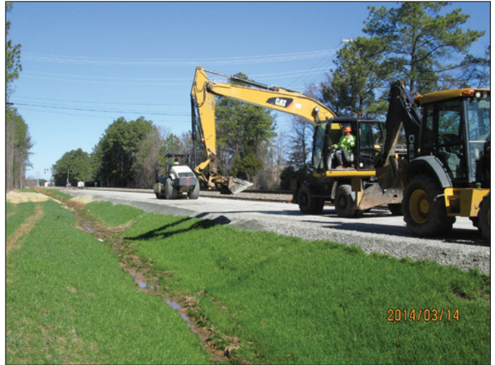
U-4716 Hopson Rd./Nelson-Clegg - Sub-ballast