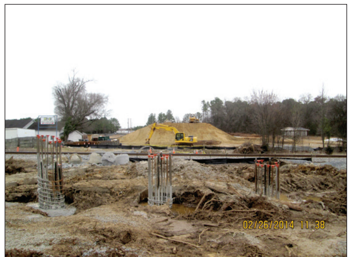
P-5208 Haydock to Junker - Column Construction