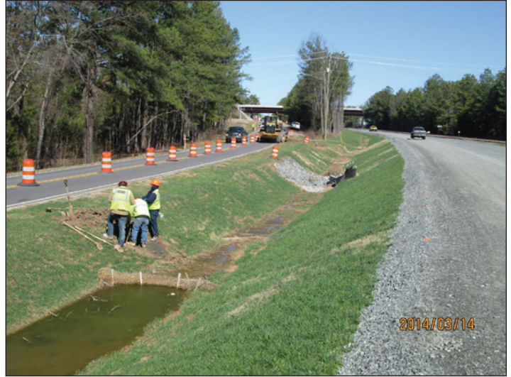
U-4716 Hopson Rd./Nelson-Clegg - Utility work