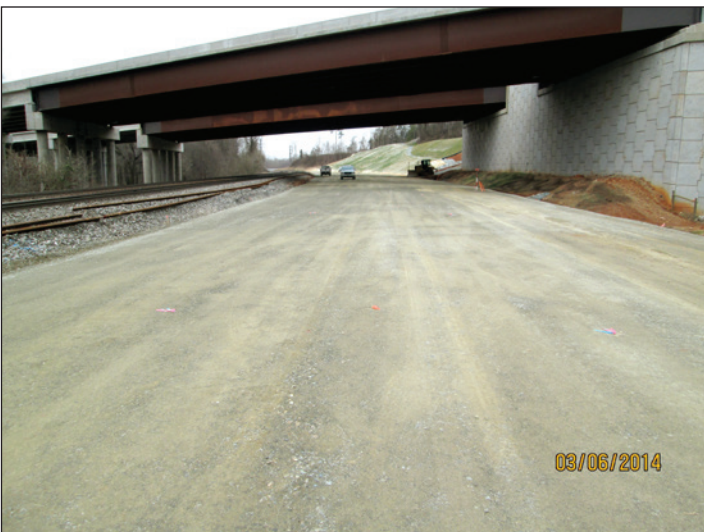
I-2304 Duke Curve Realignment - Complete Roadbed