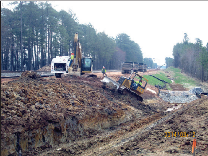
U-4716 Hopson Rd./Nelson-Clegg - Grading