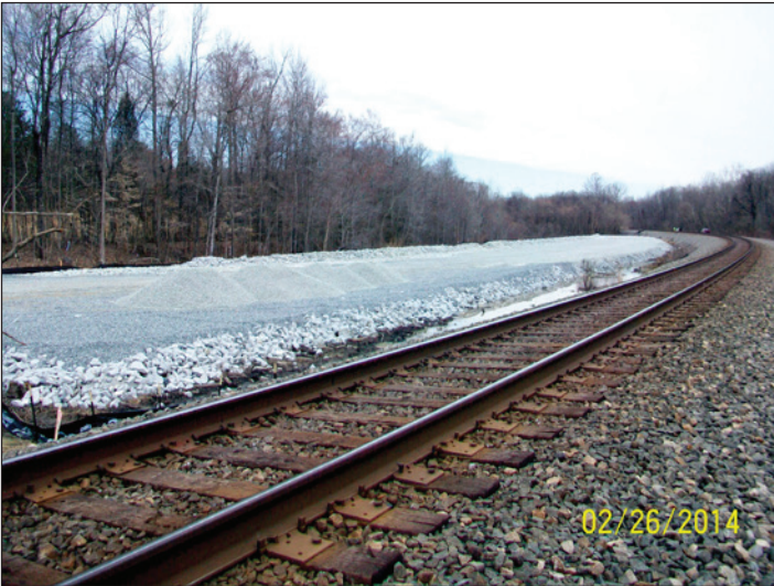
C-4901 Bowers to Lake - Grading