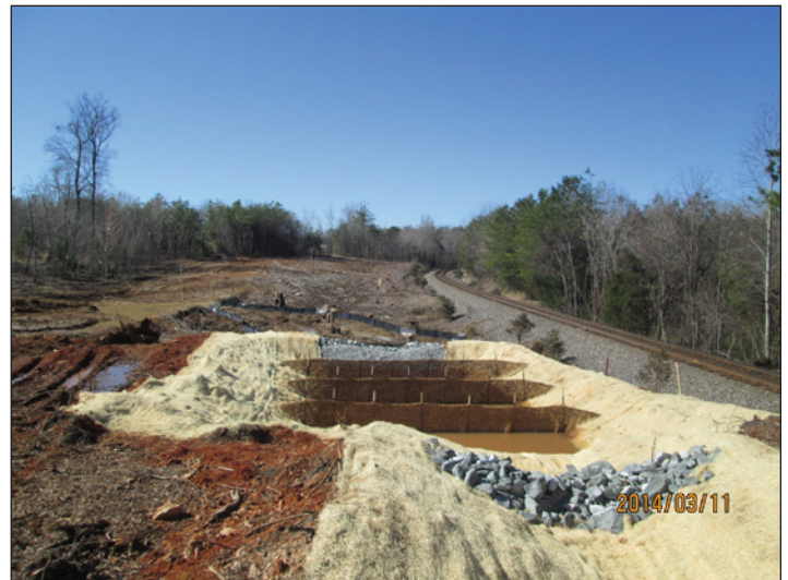
P-5205 Haw River Passing Siding - Erosion Control