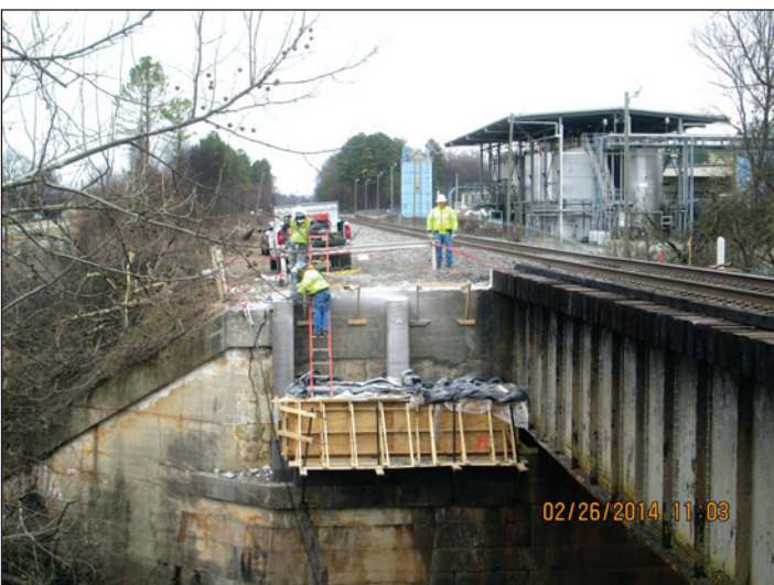
P-5208 Haydock to Junker - Bridge Structure