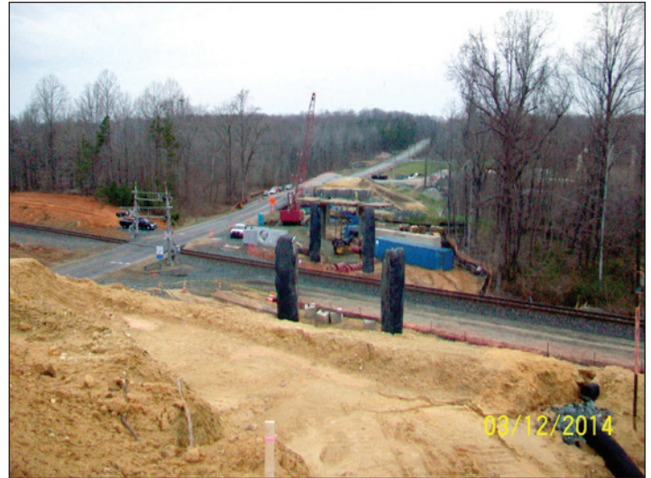
C-4901 Upper Lake Road - Overpass Substructure