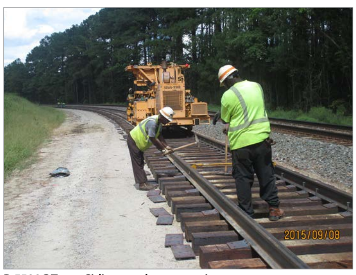
P-5500C Tryon Siding, track construction