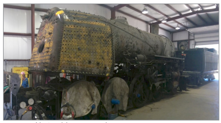
Restoration of the Consolidation #1702 underway

Until 2004, the Great Smoky Mountains Railroad operated the historic Consolidation #1702 steam engine on their excursions. Partnering with Swain County, GSMR is currently restoring the #1702 locomotive which was originally built in the 1940s. To accommodate its use, a turn table was recently constructed in Bryson City allowing the locomotive to be guickly turned around in preparation for the next journey. So far in 2015 GSMR has experienced a 20% increase in customers over the previous year and many future improvements have been identified to continue growing the business which is central to the tourism economy of the area. Great Smoky Mountains Railroad connects Bryson City with Asheville via the Blue Ridge Southern Railroad. Although there is no freight customer currently occupying the roughly 53 mile line between Dillsboro and Andrews, GSMR is equipped with 4 diesel locomotives and has experience handling freight. Sticks of rail and other track material for upcoming upgrades to sections of curved track will be imported by GSMR via rail. NCDOT continues to support GSMR in their efforts to preserve this historic corridor and return rail freight traffic to the region.