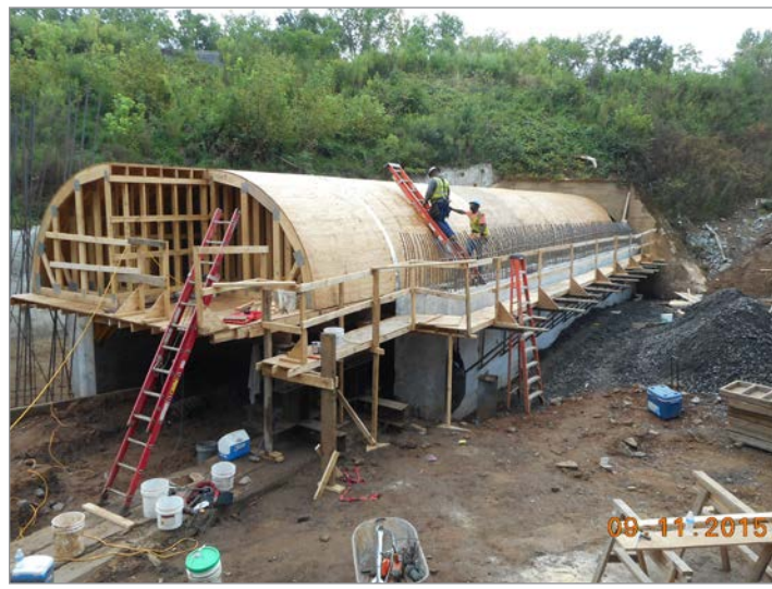
P-5208 Haydock to Junker, arch culvert construction