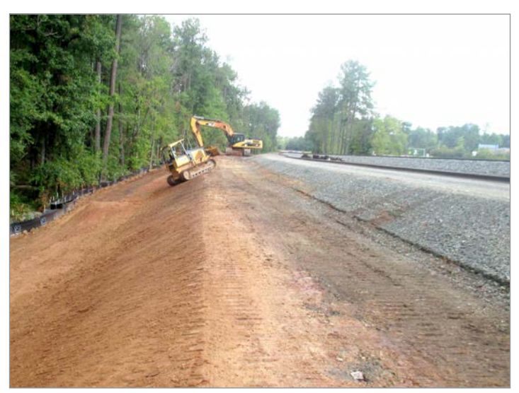
U-4716 Nelson to Clegg Passing Siding, final phase grading