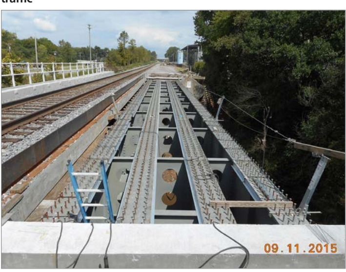
P-5208A Haydock to Junker, Rocky River Bridge Construction