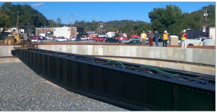
Bryson City Turntable

Until 2004, the Great Smoky Mountains Railroad operated the historic Consolidation #1702 steam engine on their excursions. Partnering with Swain County, GSMR is currently restoring the #1702 locomotive which was originally built in the 1940s. To accommodate its use, a turn table was recently constructed in Bryson City allowing the locomotive to be guickly turned around in preparation for the next journey. So far in 2015 GSMR has experienced a 20% increase in customers over the previous year and many future improvements have been identified to continue growing the business which is central to the tourism economy of the area. Great Smoky Mountains Railroad connects Bryson City with Asheville via the Blue Ridge Southern Railroad. Although there is no freight customer currently occupying the roughly 53 mile line between Dillsboro and Andrews, GSMR is equipped with 4 diesel locomotives and has experience handling freight. Sticks of rail and other track material for upcoming upgrades to sections of curved track will be imported by GSMR via rail. NCDOT continues to support GSMR in their efforts to preserve this historic corridor and return rail freight traffic to the region.