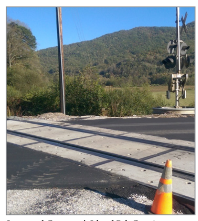
Improved Governor's Island Rd. Crossing