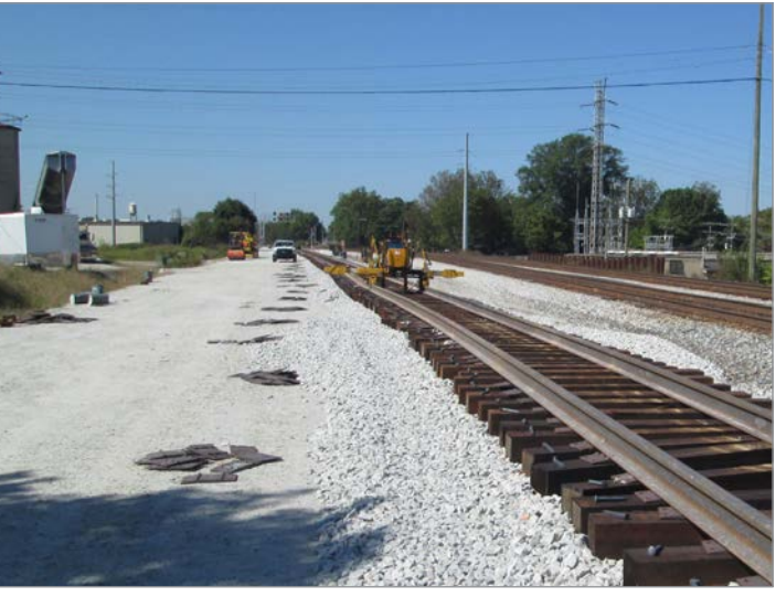
U-3459 Klumac Road, final track construction