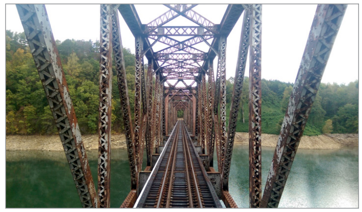
Past projects have included funds to re-deck bridges