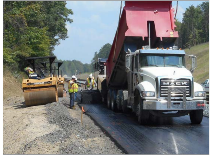
C-4901 Bowers to Lake, paving