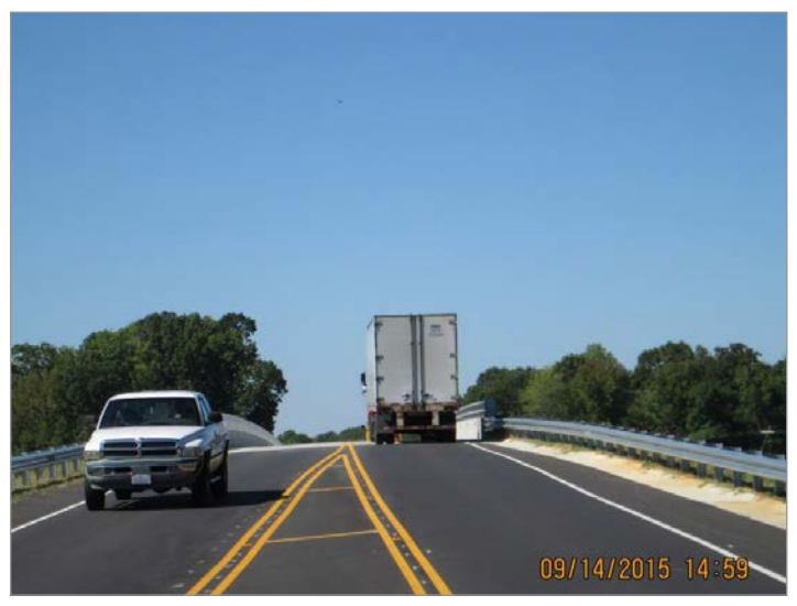
P-5206 Reid to North Kannapolis, Peeler Road Bridge open to traffic