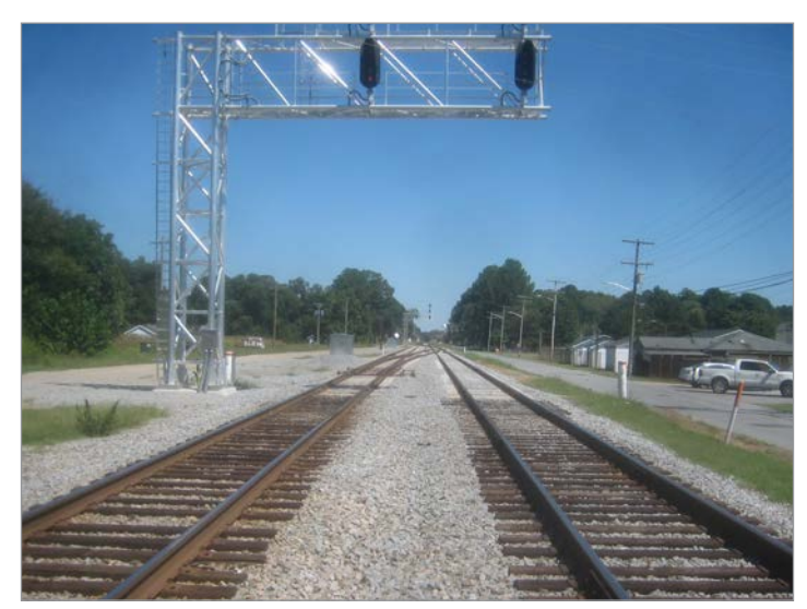
Congestion Mitigation Project, CP Enfield complete