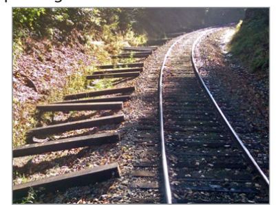
Final 2014 crossties await installation

Jackson and Swain counties. NCDOT has partnered with GSMR to provide funding for improvements to the line including bridge and tunnel maintenance, switch and crosstie replacements, and crossing safety upgrades. At the time of the meeting, GSMR workers were installing the final 40 crossties for a track upgrade project funded through the Short Line Infrastructure Assistance Program in 2014. Freight Rail & Rail Crossing Safety (FRRCSI) program funds were recently used to provide matching funds for upgrades to the at-grade crossing surface on Governors Island Road.