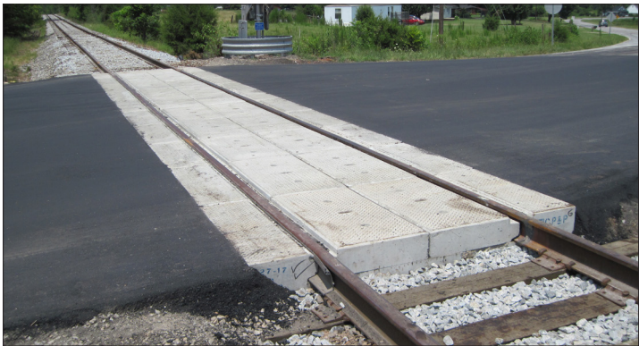
White Plains Road after improvements