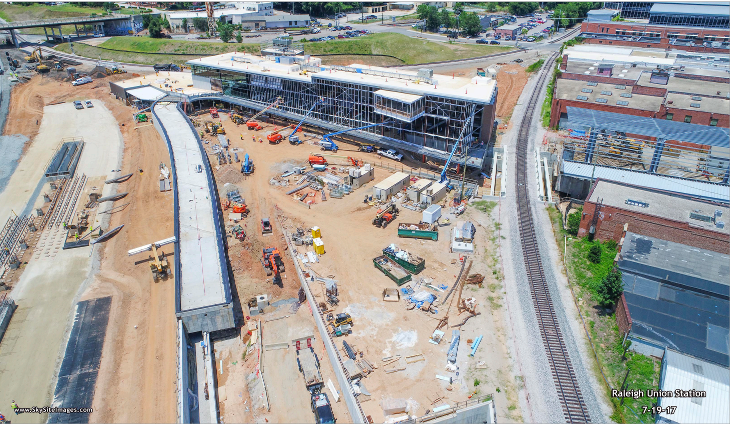
View of south elevation with passenger concourse center of photo, and footings for center island platform left edge of photo