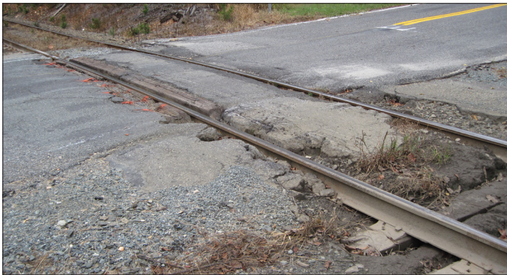
Hidden Ridge Trail before improvements