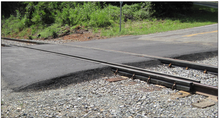
Hidden Ridge Trail after improvements