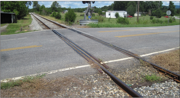
White Plains Road before improvements