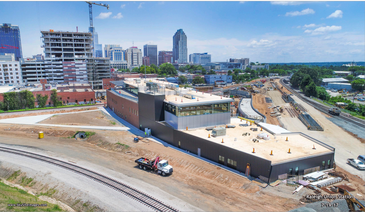
View of north and west elevations