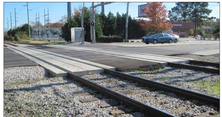
Evans Road after improvements