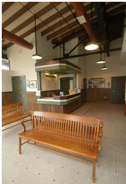
Interior, waiting room

by the Historic Salisbury Foundation in 1985. A restoration of the depot was completed in 1993 by the Foundation, NCDOT and Amtrak. Additional improvements were made to the passenger waiting room in 1999 when station attendants began staffing the waiting rooms. In 2009 a new platform and canopy were built by the City of Salisbury with a majority of the funding coming from NCDOT. The canopy was designed by North Carolina architect