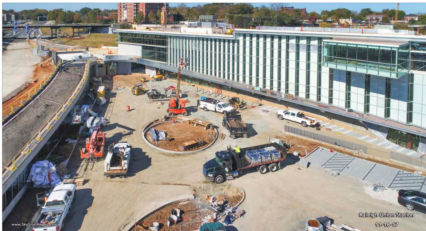
Drop off loop construction