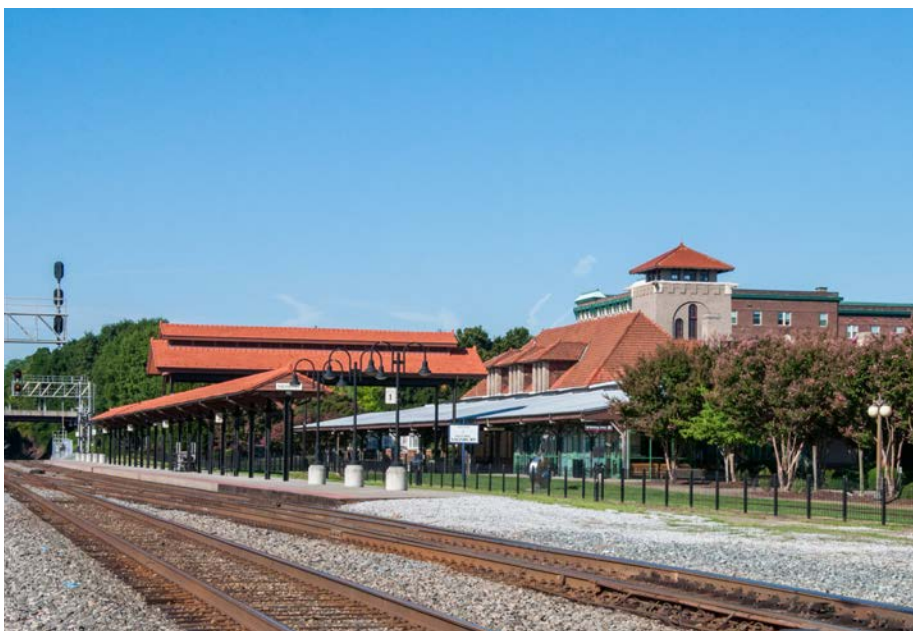
1908 Historic Salisbury Depot with 2009 canopy addition

January Railroad Trivia Answer: On the NS Albemarle Sound trestle. Completed in 1910 the trestle was 5.05 miles long. The longest trestle ever constructed in NC and one of the longest continuous trestles ever built in the USA. Two NS diesel locomotives and one car fell through the trestle into 20' of water. The trestle was repaired and returned to service for another 30 years. The new NS closed the trestle on January 3, 1987 and removed the structure the next year.