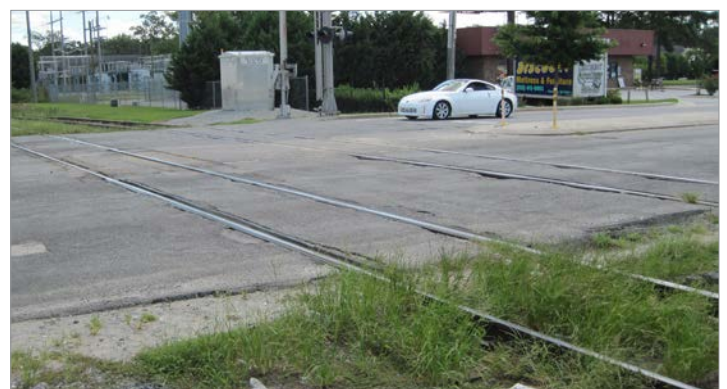
Evans Road before improvements