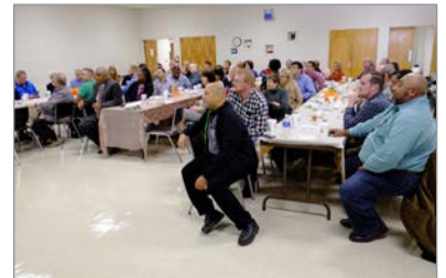
Rail Division Staff