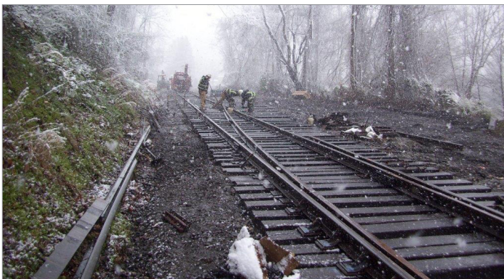
Robinson Siding Extension

In June 2018, GSMR completed a 500-foot extension of the Robinson Siding. This improvement accommodates longer train sets without blocking crossings or turnouts and provides additional storage for unused rail cars. The project also facilitates daily operational efficiency of the GSMR network. NCDOT is pleased to be a partner with the Great Smoky Mountains Railroad on these projects that enhance the safety, reliability, and efficiency of rail operations, while supporting economic development across North Carolina.