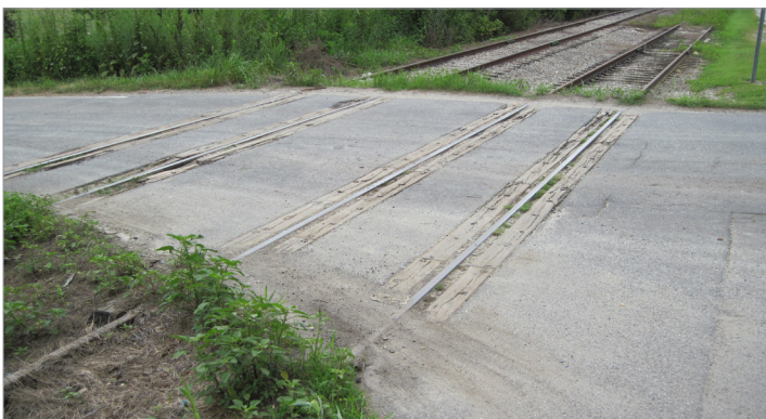
Robbinsville Road before improvements

The second crossing was on SR 1318, Lewis Store Road near Walstonburg, NC. This single track crossing was asphalt with no flangeway material, becoming uneven and rough. The crossing surface was replaced with rail seal and asphalt providing a better ride for the residents of this area.