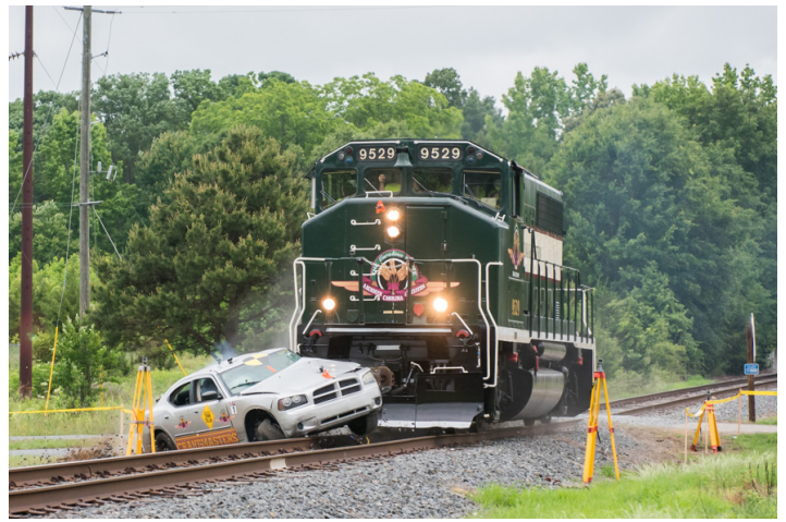
The moment of impact

To illustrate this point, BeRailSafe partnered with North Carolina Operation Lifesaver to stage and record a simulation showing a moving 'target' vehicle trying to beat a train at a railroad crossing in Star, NC (Montgomery County.) The car, fitted with properly and improperly restrained child and adult crash dummies, was struck by a locomotive while trying to 'beat a train' at the highway-grade crossing.