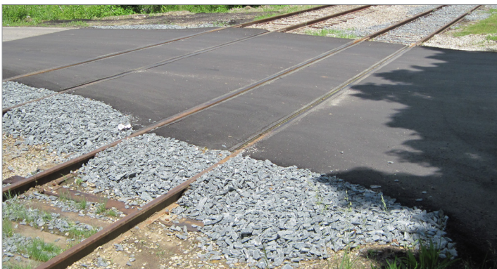
Robbinsville Road after improvements