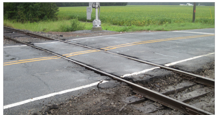
Lewis Store Road before improvements