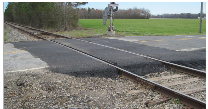
Lewis Store Road after improvements