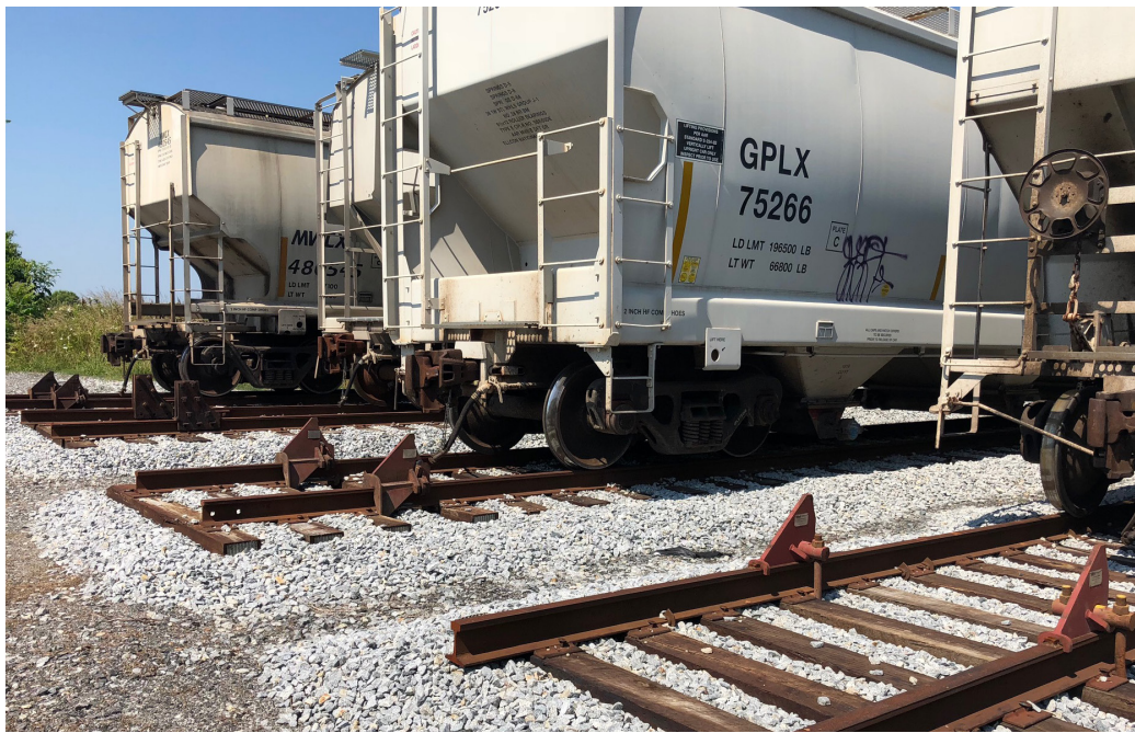
The ACR Rail Yard expansion included the addition of 3,175 feet of storage track.

The Alexander Railroad Company (ARC) is a short line railroad that operates between Statesville and Taylorsville in North Carolina's Western Piedmont. The rail line serves businesses in western Iredell and eastern Alexander counties. Founded in 1945, the rail line was purchased from a predecessor of Norfolk Southern. It connects to the Norfolk Southern line in Statesville, transferring freight rail shipments with a daily-used interchange. The ARC operates 18 miles of track while moving over 4,000 carloads (or ~320,000 RR tons) of freight annually.