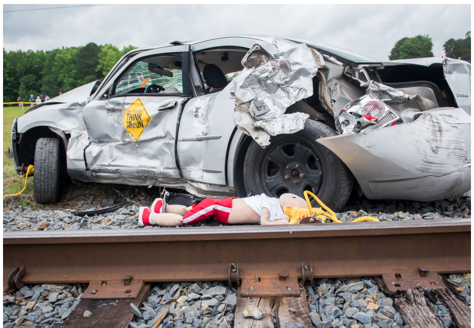
Close up of the aftermath of the train-car collision

This was a first-of-its-kind event with a moving target vehicle struck by a moving locomotive. Staged train crashes are not new to the highway safety community. All previous crashes utilized a stationary vehicle on the tracks. The BeRailSafe crash set a new standard for crossing crash safety and analysis by incorporating a moving target vehicle. The crash crew engineered a unique pulley system