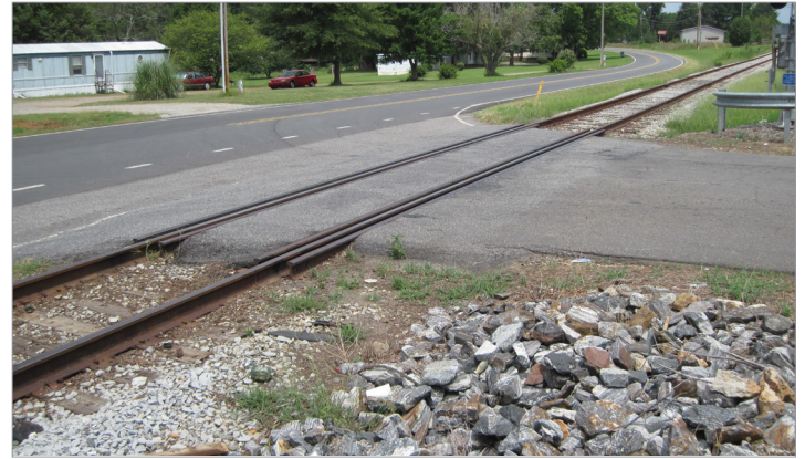
Scotts Creek Road before improvements