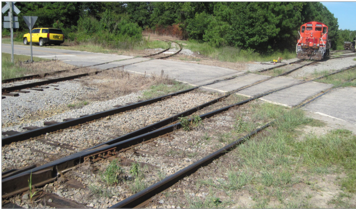
Corbett Road before improvements