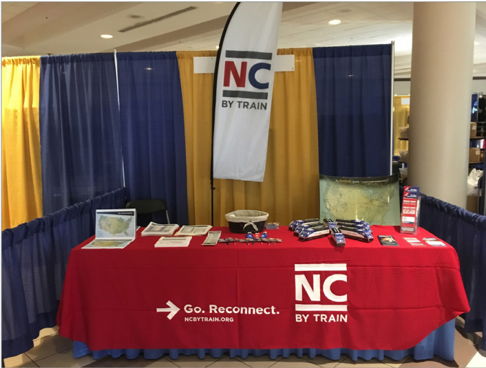
Table at N.C. A&T Alumni Event

The schools were North Carolina A&T State University in Greensboro, Livingstone College in Salisbury, Johnson C. Smith University in Charlotte, and North Carolina Central University in Durham.