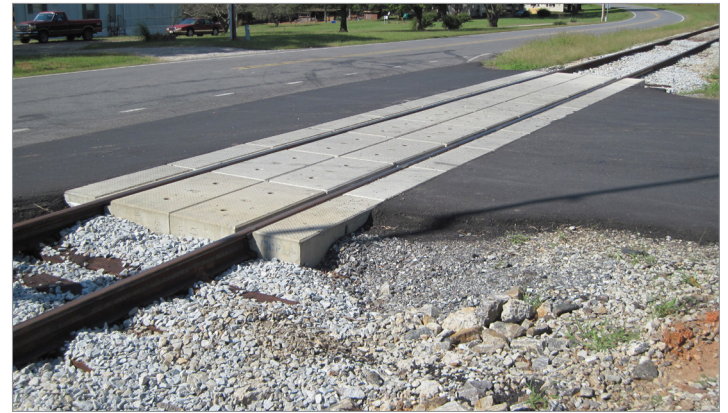
Scotts Creek Road after improvements