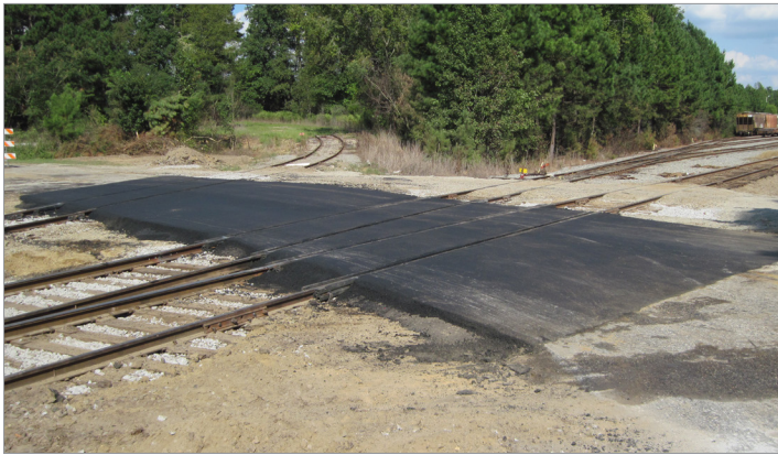
Corbett Road after improvements